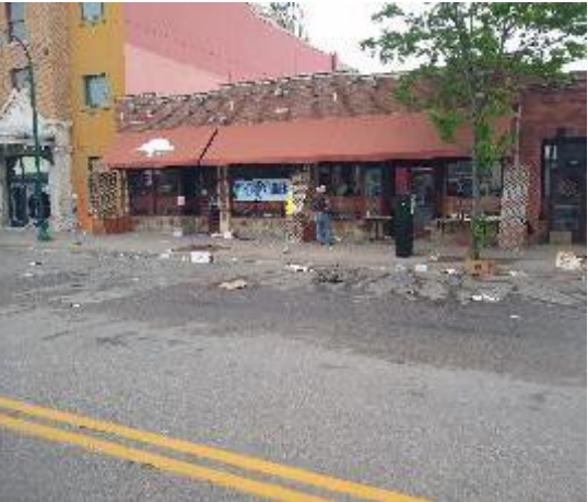
Downtown Longfellow, Minneapolis