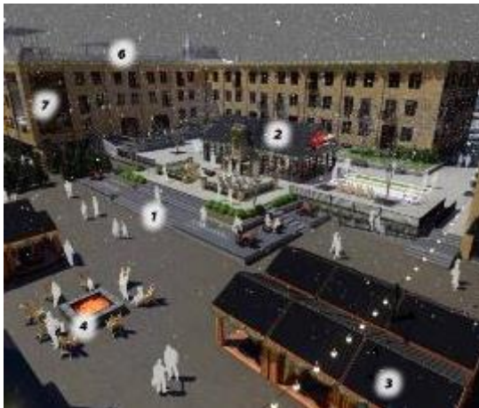
Downtown Artist Housing, Chaska