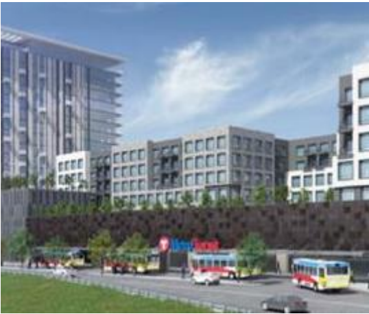
98 th Street Station, Bloomington