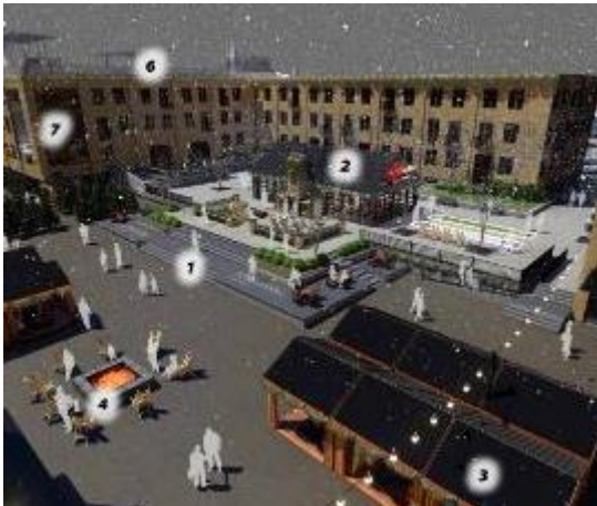
Downtown Artist Housing, Chaska