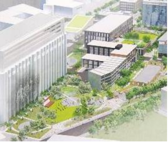
Towerside District Stormwater System, Minneapolis