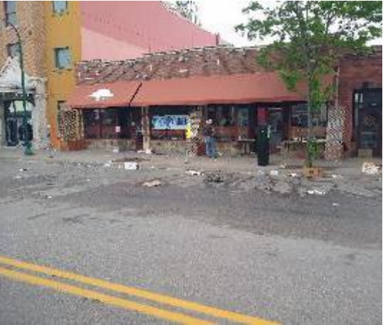
Downtown Longfellow, Minneapolis