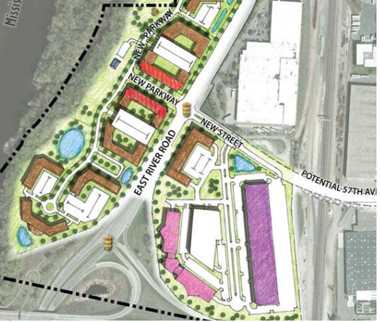
Northstar TIF Masterplan, Fridley