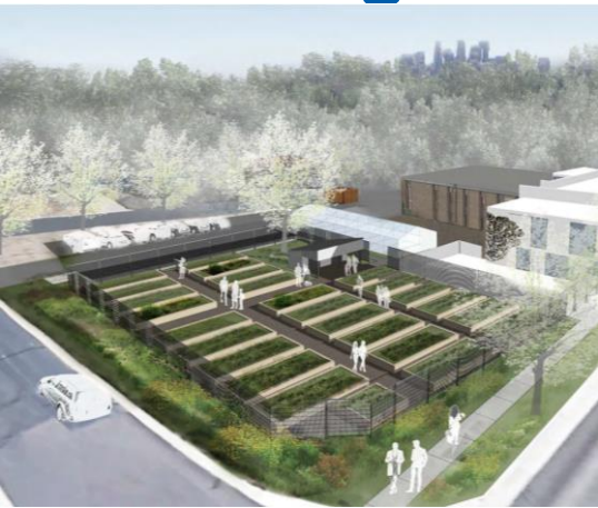
Center for Asian and Pacific Islanders, Brooklyn Center