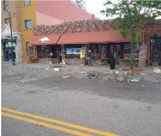
Downtown Longfellow, Minneapolis