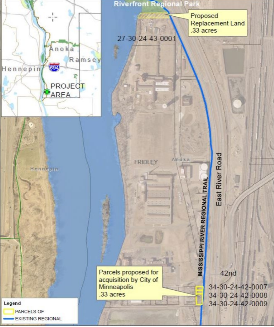
Anoka County's Mississippi River Regional Trail Land Conversion