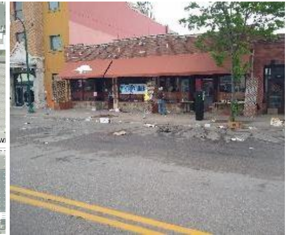
Downtown Longfellow, Minneapolis