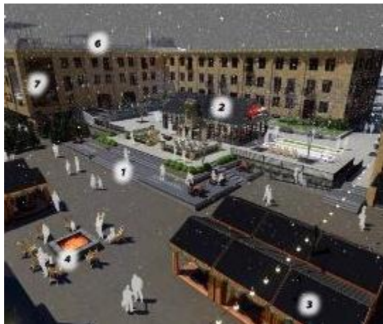
Downtown Artist Housing, Chaska