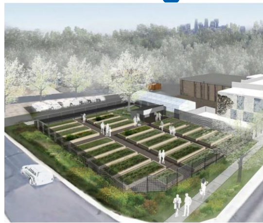
Center for Asian and Pacific Islanders, Brooklyn Center