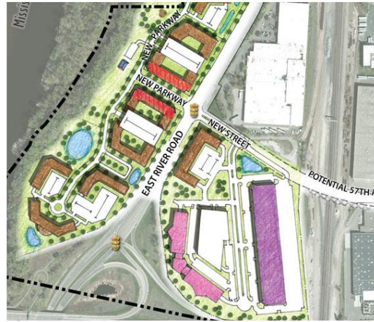
Northstar TIF Masterplan, Fridley