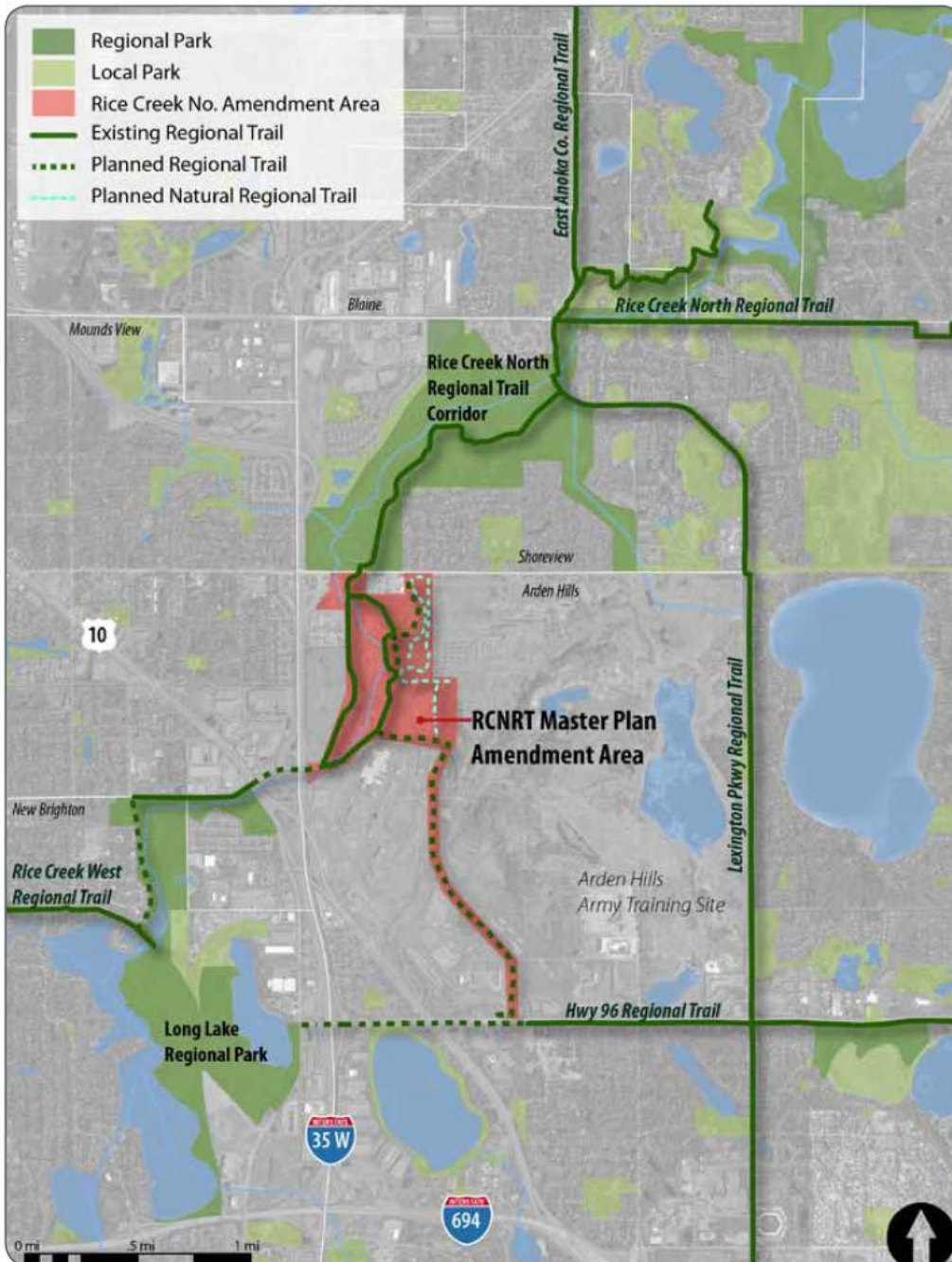
Figure 1: Location of the Rice Creek North Regional Trail

1. Boundaries and Acquisition The Rice Creek North Regional Trail extends 14 miles from the Rice Creek West Regional Trail at Long Lake Regional Park to the Rice Creek Chain of Lake Park Reserve in Anoka County. This master plan amendment proposes to expand the regional trail in the central portion of the trail corridor within Arden Hills, as shown in Figure 1 .