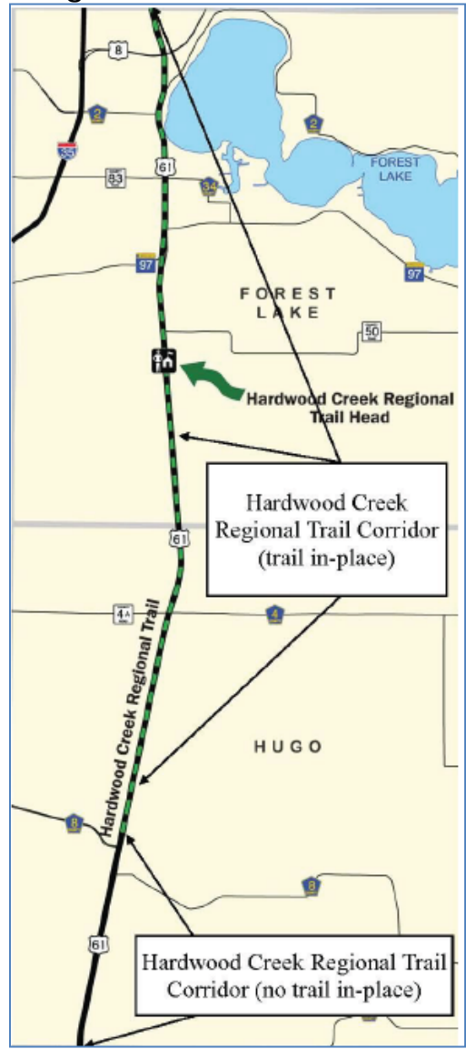
Figure 1: Hardwood Creek Regional Trail

The regional trail will generally follow an abandoned railroad corridor from the border of Ramsey County to the border of Chisago County and will make the following connections along its route: