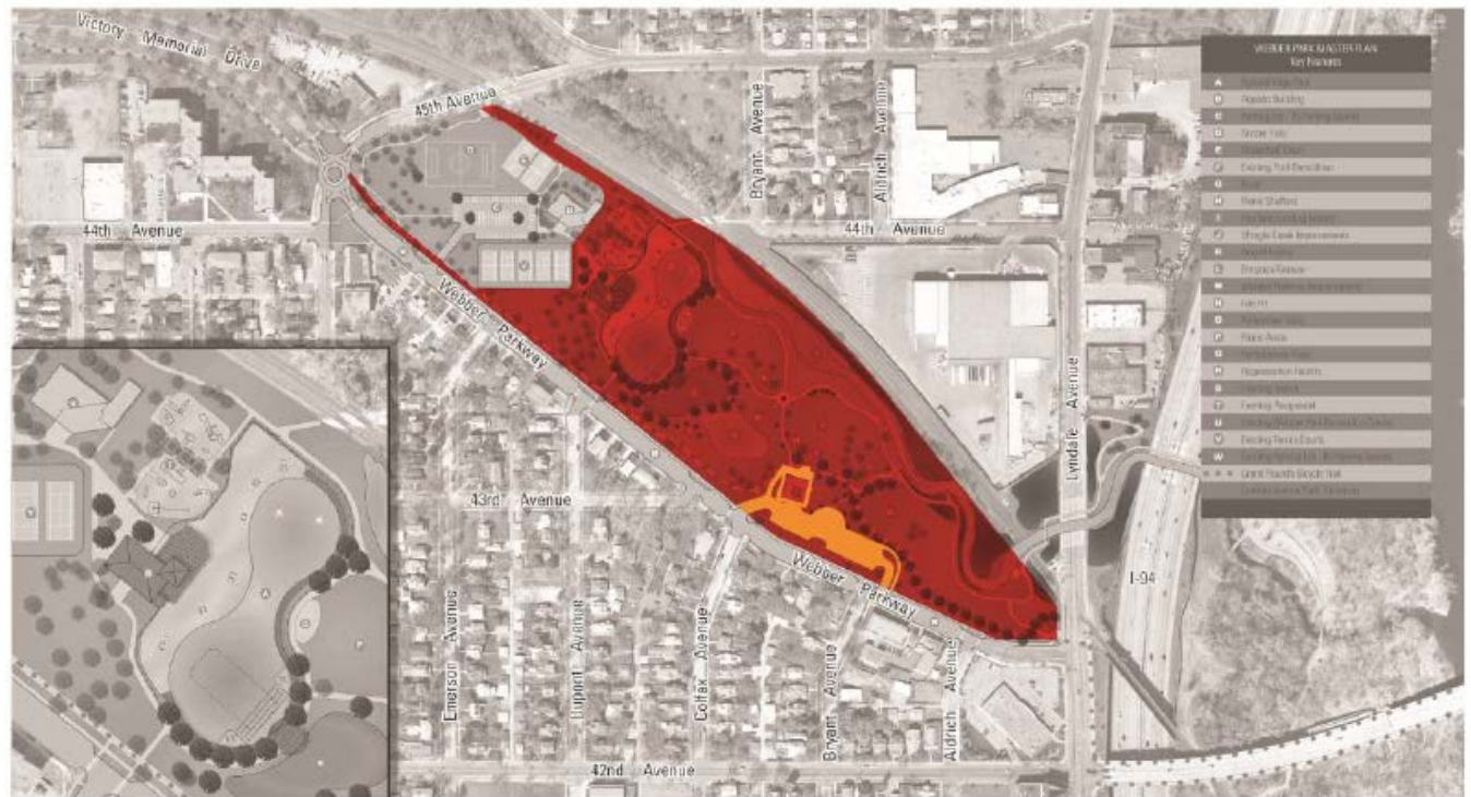
Figure 3: Proposed boundary expansion and easement area

2. Demand Forecast: The expansion of North Mississippi Regional Park will provide continuous regional trail connections, swimming facilities and picnicking opportunities. Trails within Webber Park facilitate continuous connections between Shingle Creek Regional Trail, Victory Memorial Parkway Regional Trail, St. Anthony Parkway Regional Trail and North Mississippi Regional Park. These facilities had the following estimated visits in 2011: