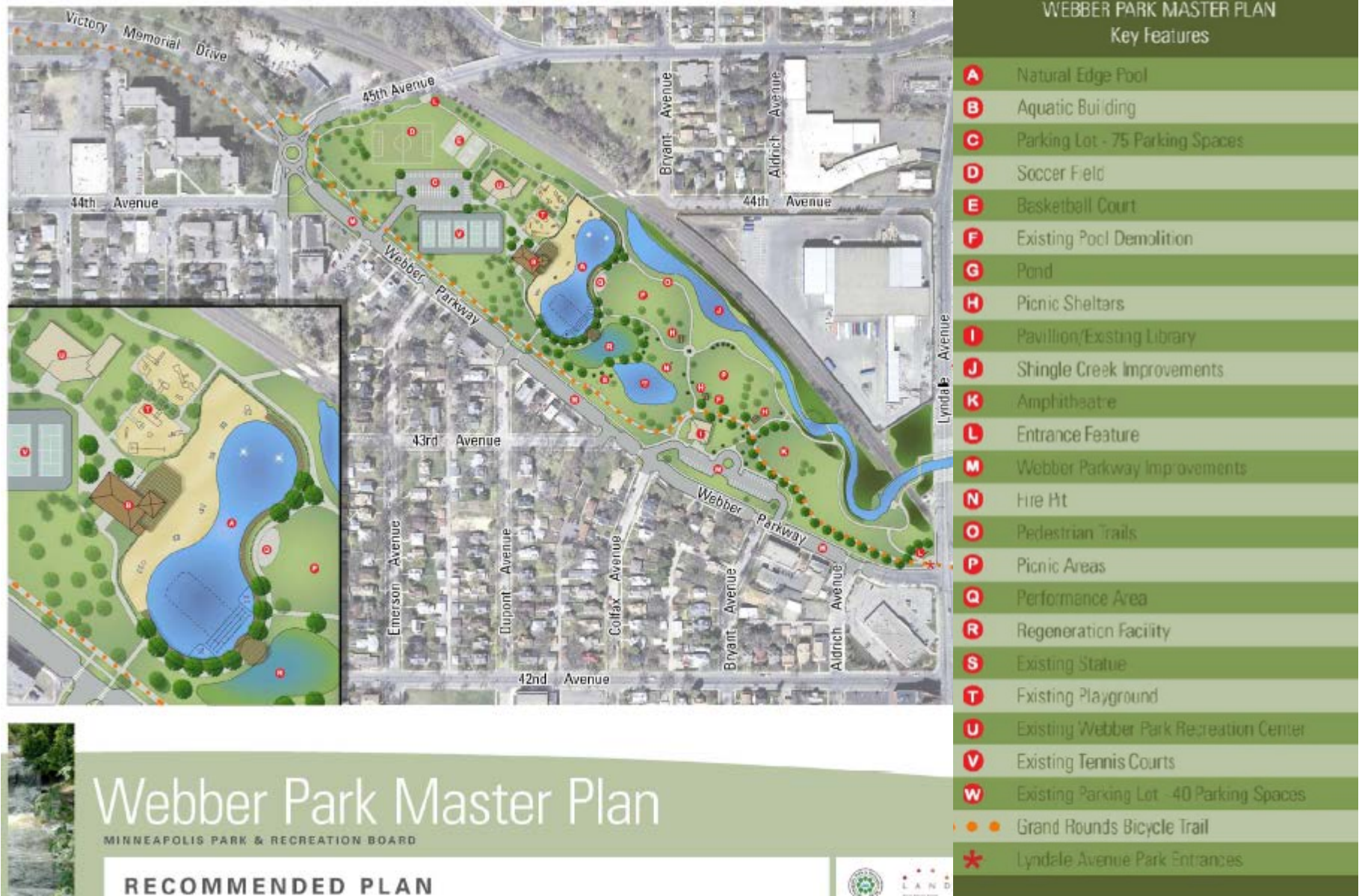
Figure 5: Master site plan for Webber Park