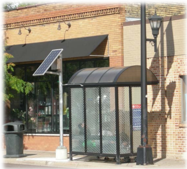
2012: Franklin Ave Shelters