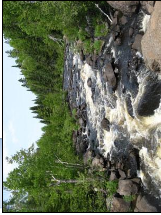
MCES and partners monitored water quality at 225 river, lake and stream locations in 2013.