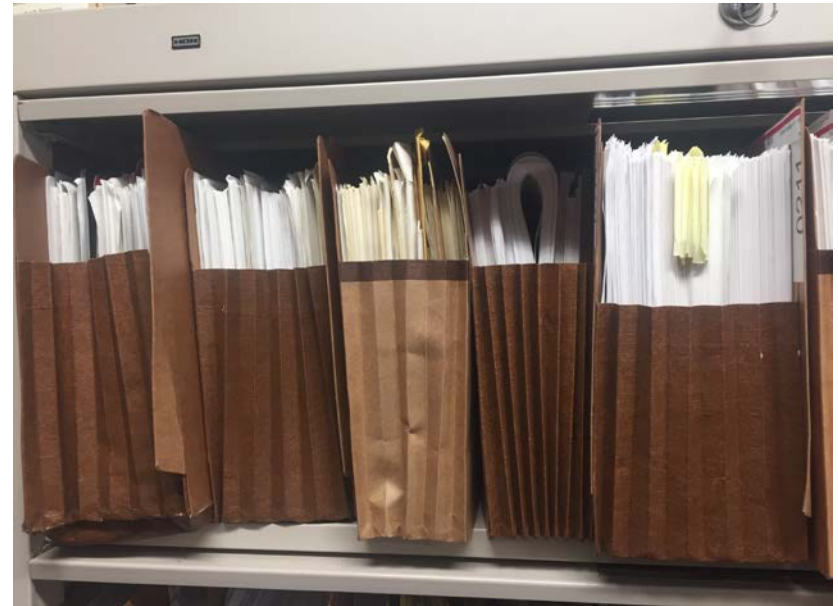
Documentation for Single Permit