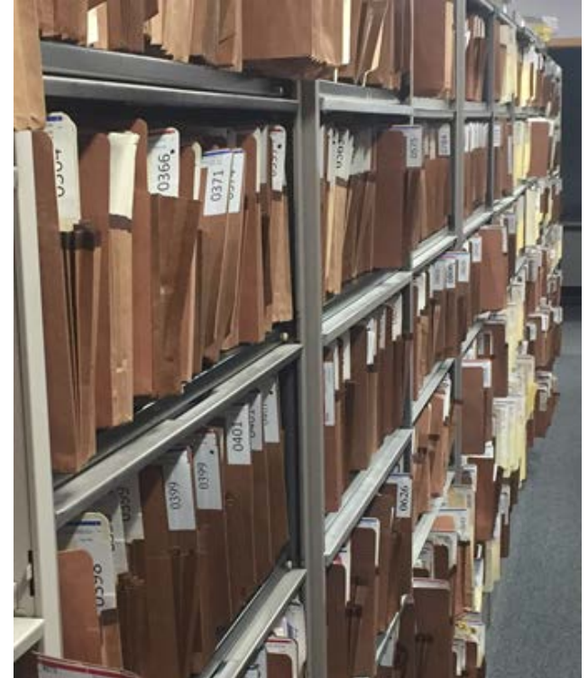
Current file storage system