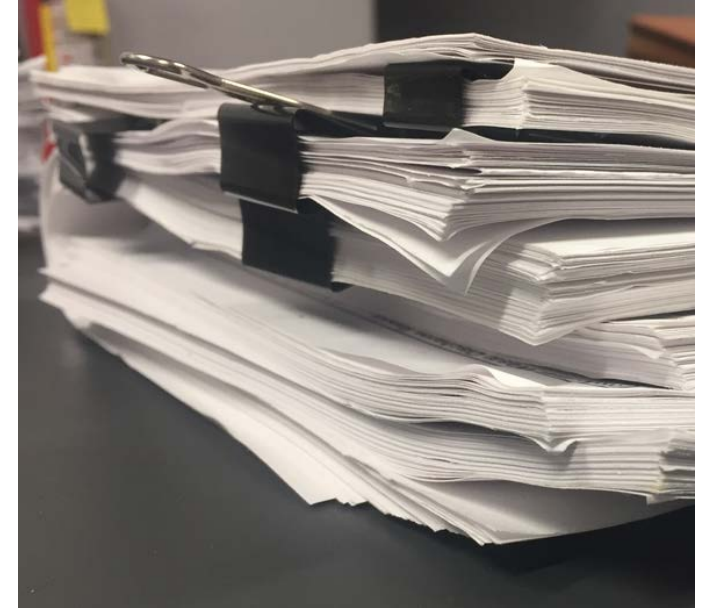
One year of Permittee Documentation