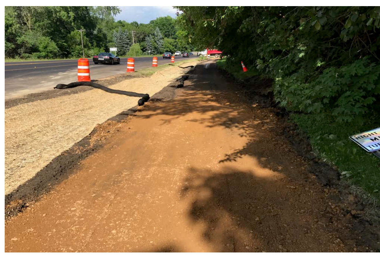
Restoration and temporary trail reconstruction following repair