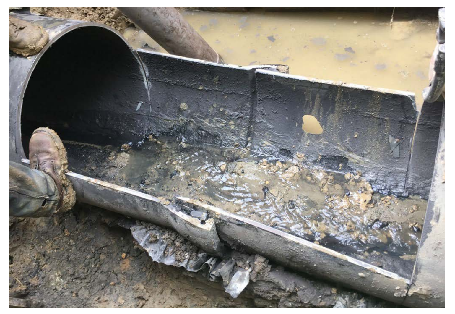
Cut-away of damaged pipe section prior to repair showing hole in pipe that was source of sewage release