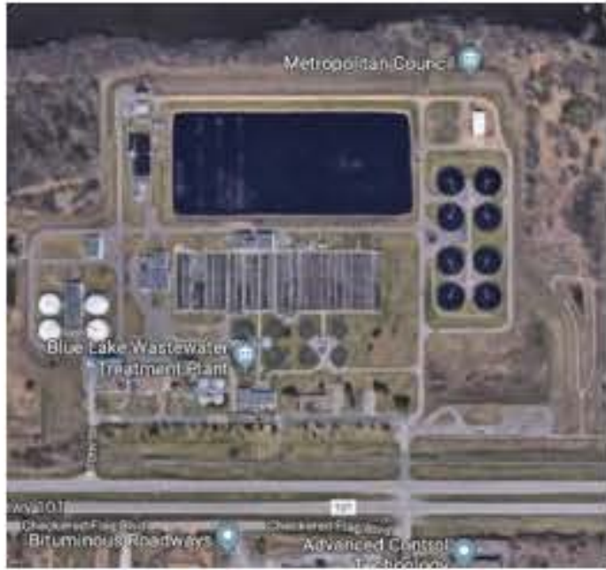
BLUE LAKE WASTEWATER TREATMENT PLANT 8957 COUNTY ROAD 101, SHAKOPEE, MN