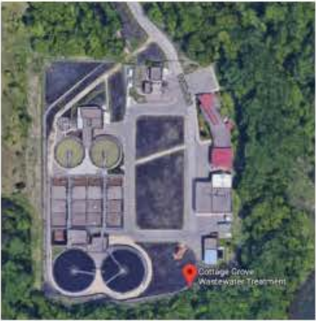
EAGLES POINT WASTEWATER TREATMENT PLANT 9211 110th ST S, COTTAGE GROVE, MN