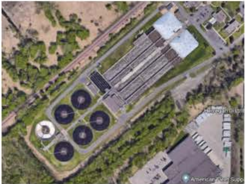
SENECA WASTEWATER TREATMENT PLANT 3750 PLANT RD, EAGAN, MN