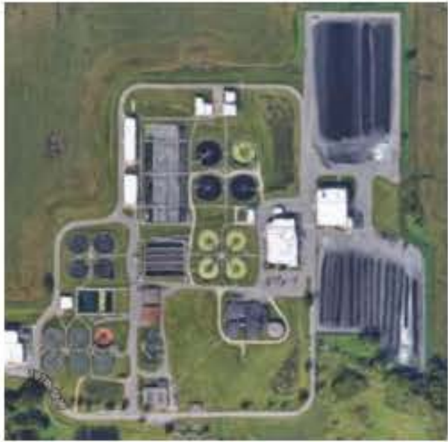
EMPIRE WASTEWATER TREATMENT PLANT 197 TH ST W, EMPIRE TOWNSHIP, MN