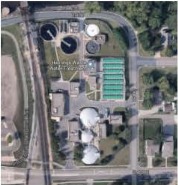
HASTINGS WASTEWATER TREATMENT PLANT 100 LEA ST, HASTINGS, MN