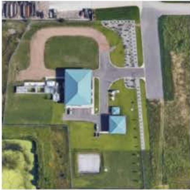
EAST BETHEL WASTEWATER TREATMENT PLANT BUCHANAN ST NE, EAST BETHEL, MN