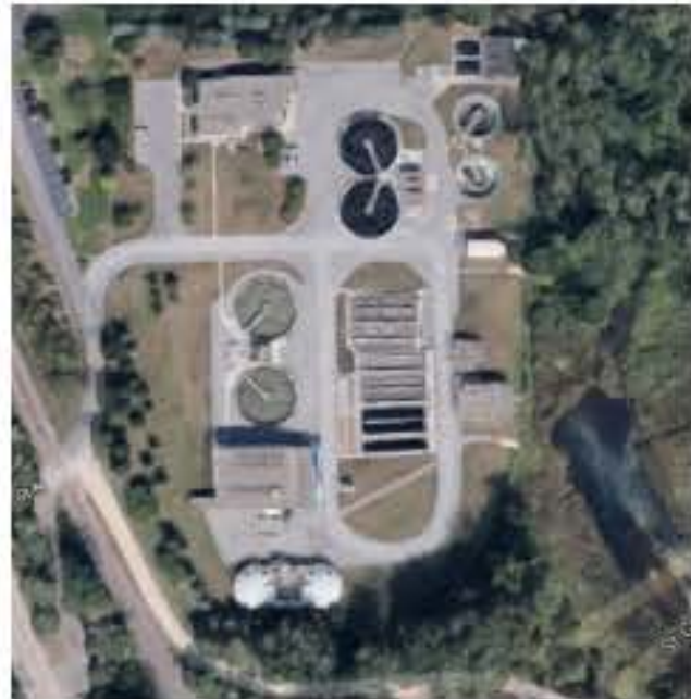
ST CROIX VALLEY WASTEWATER TREATMENT PLANT 6163 ST. CROIX TRAIL, OAK PARK HEIGHTS, MN