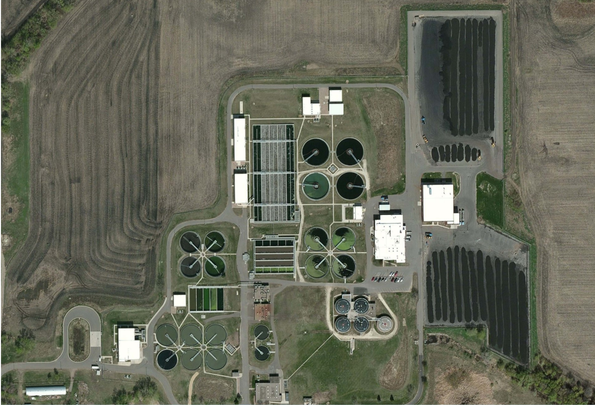
2005 - Solids Processing Capacity Expansion was Deferred