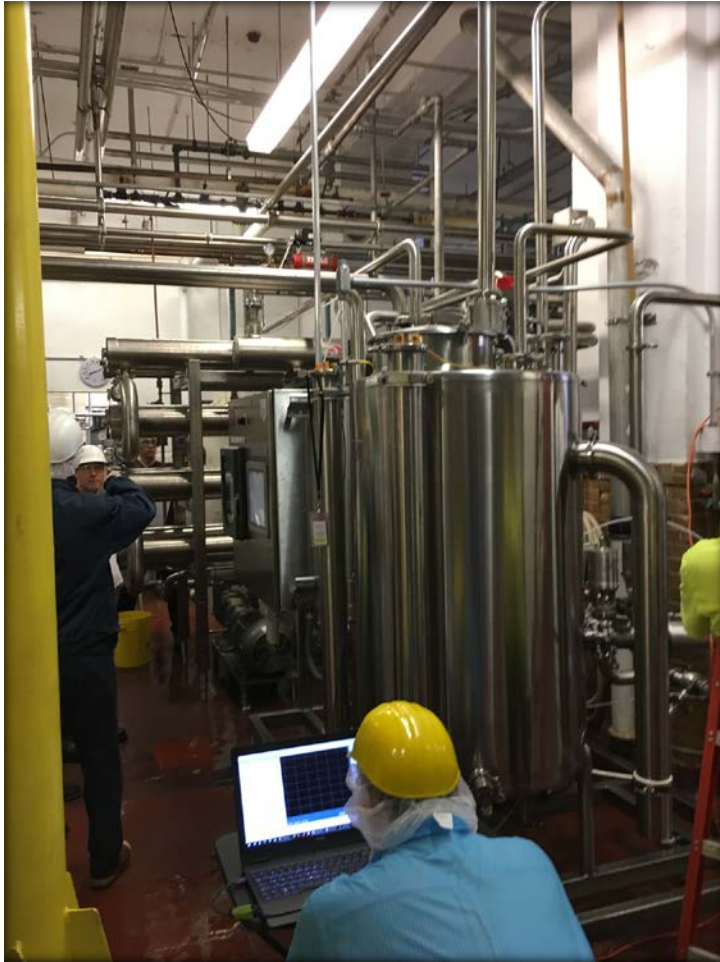
RO System at Kemp's