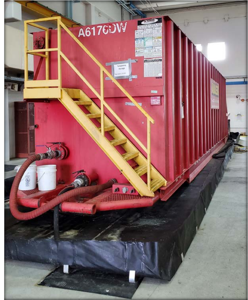
Receiving Station at Empire