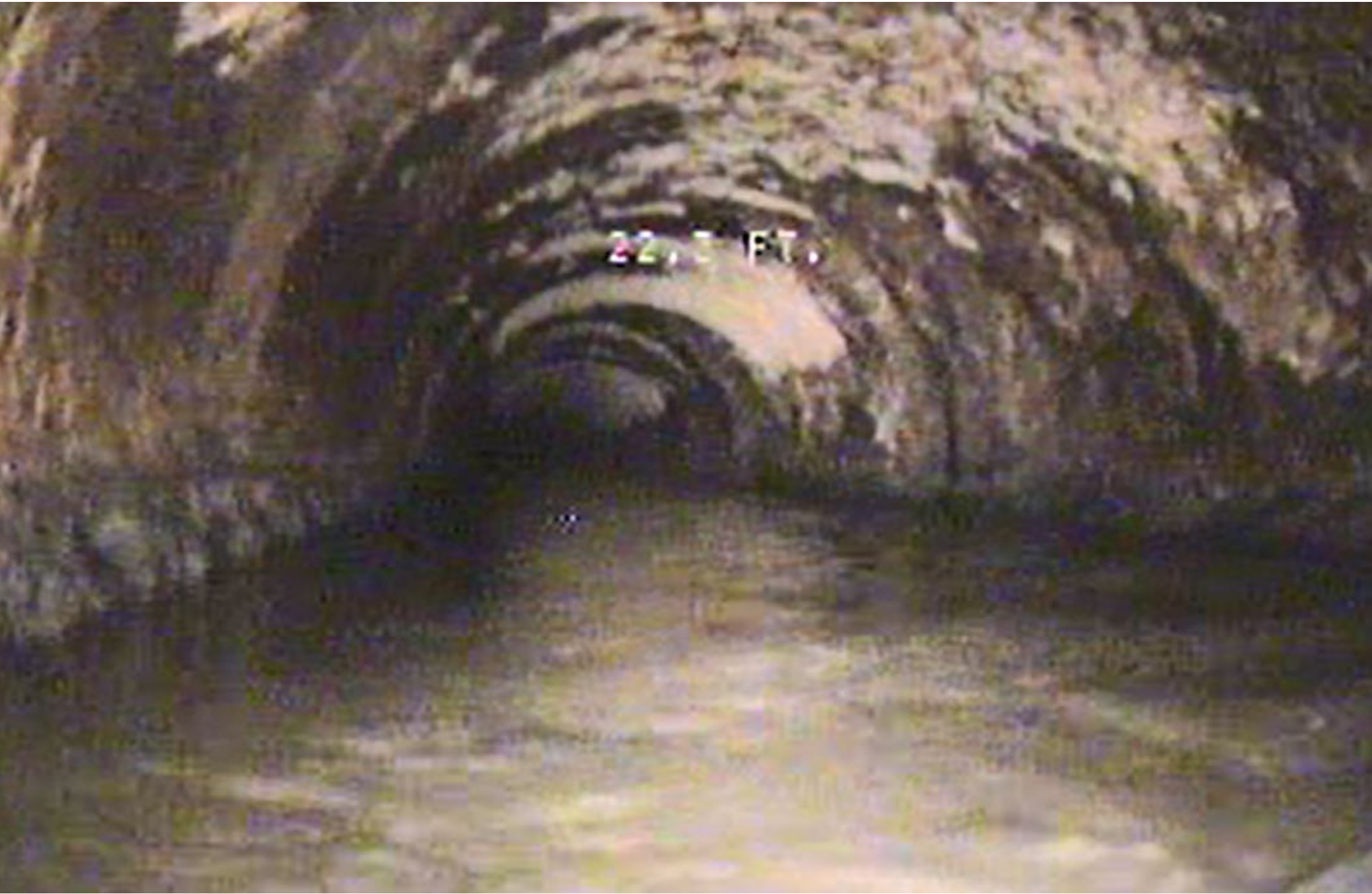
Condition 4 Sewer Pipe