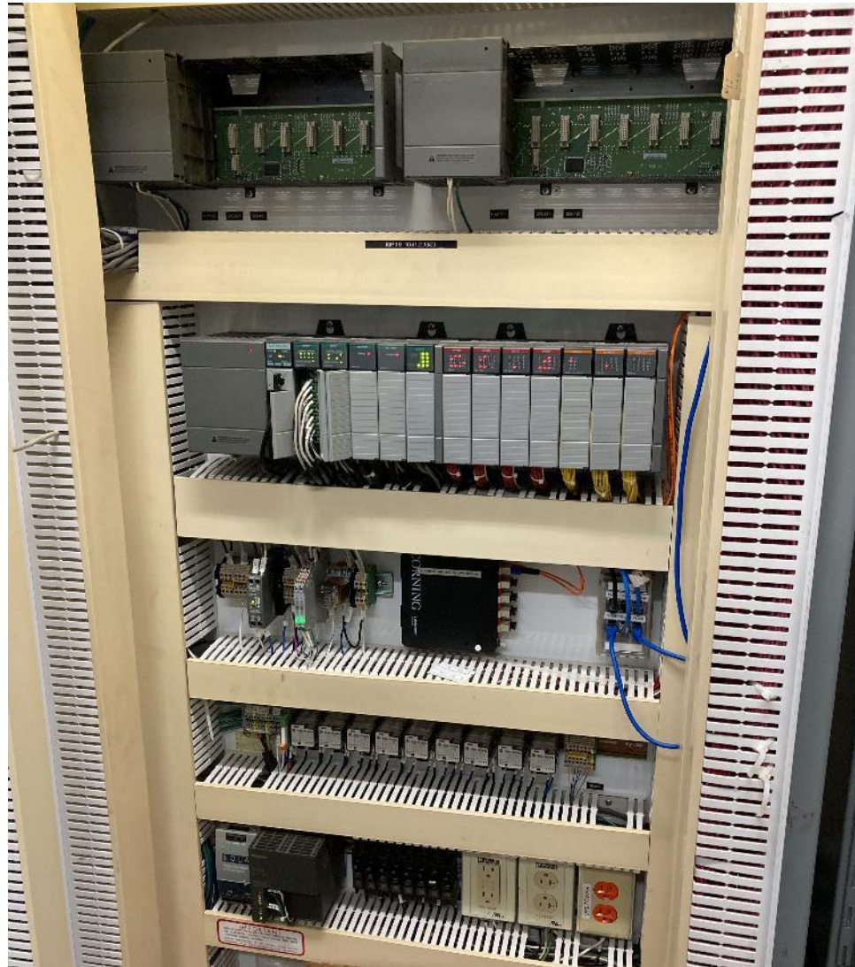
PLC PANEL BEFORE MODIFICATION