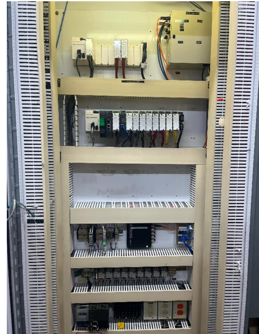
SAME PLC PANEL AFTER MODIFICATION