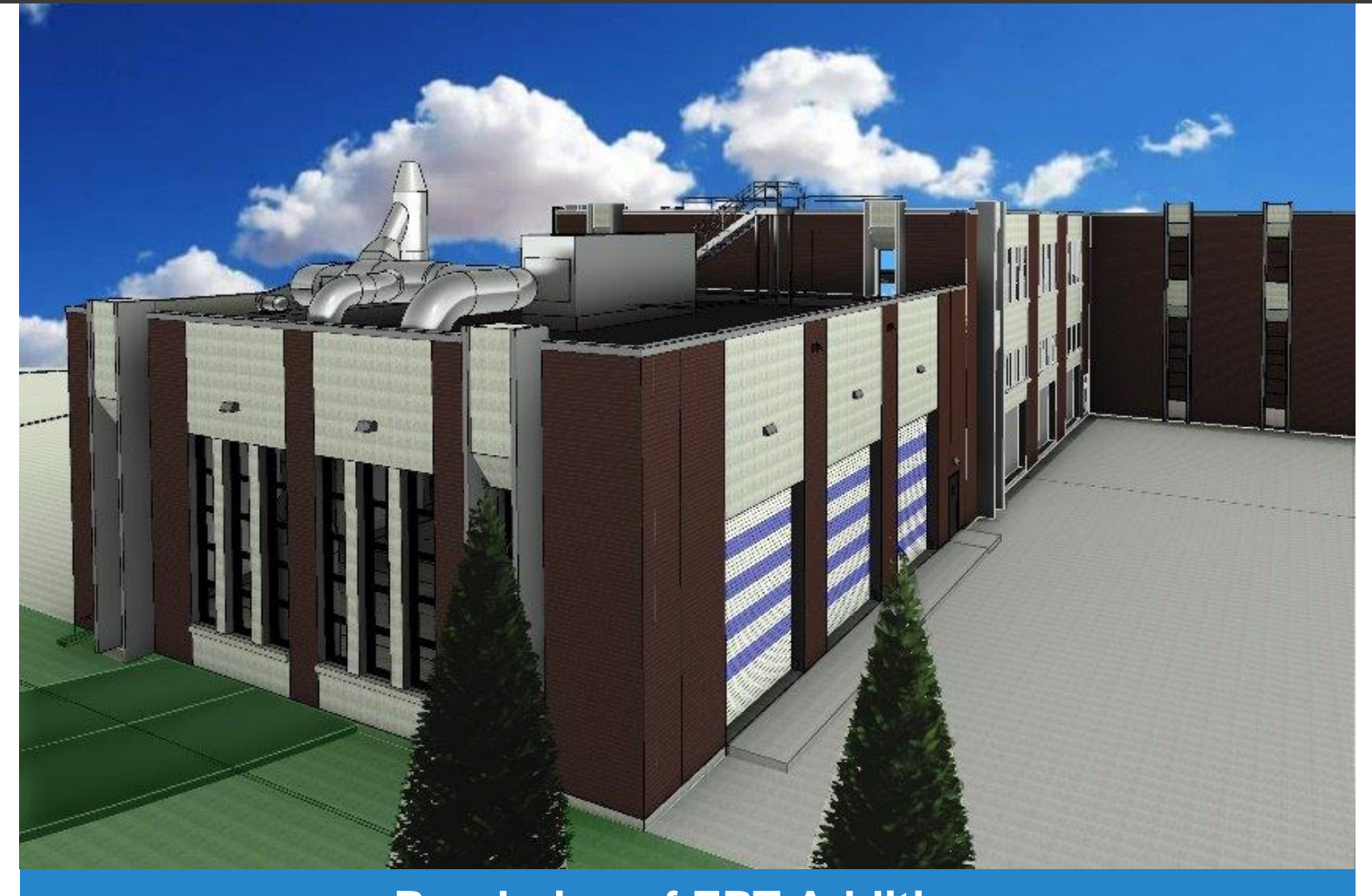
Rendering of EPT Addition