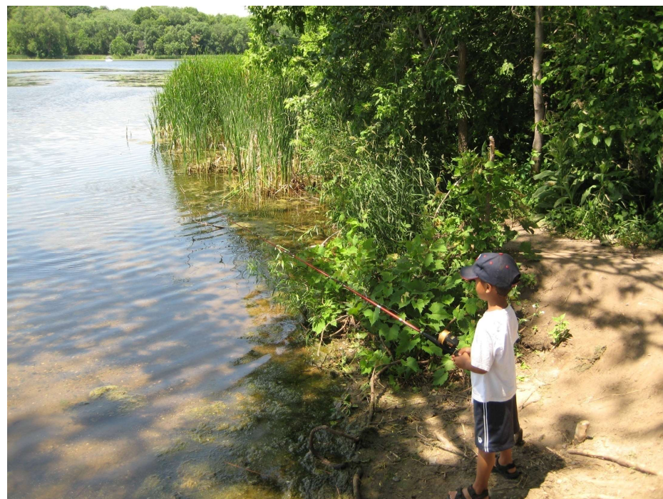
French Regional Park Three Rivers Park District