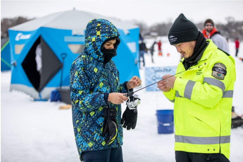
Try It Ice Fishing, Fish Lake Regional Park Three Rivers Park District