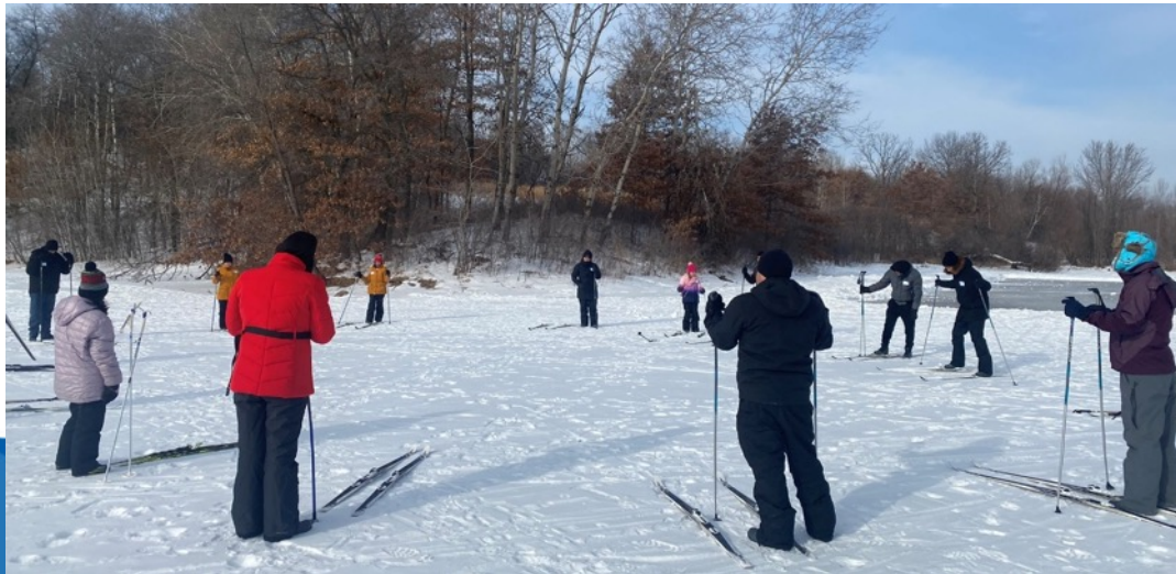
Learn to Ski with Outdoor Latino, Dakota County