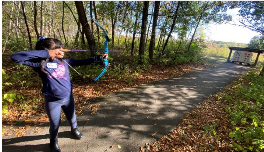
Archery in the Parks, Dakota County