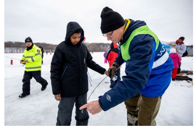
Fish Lake Regional Park