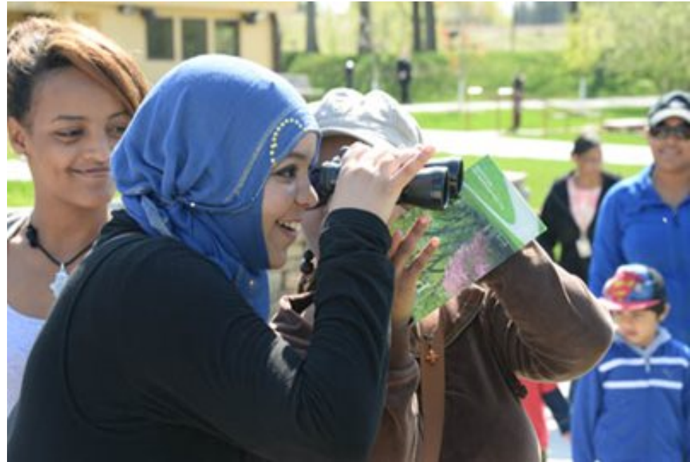
Youth engagement in Dakota County Parks