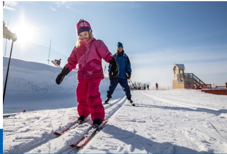
Nordic Opener, Elm Creek Park Reserve Three Rivers Park District