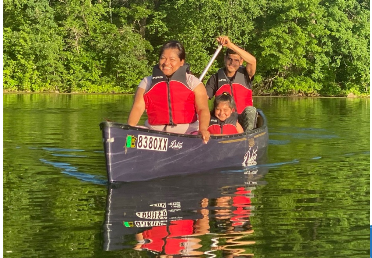
Canoeing, Lebanon Hills Regional Park, Dakota Co.