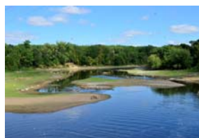
Coon Rapids Dam Regional Park— Anoka County & Three Rivers Park District