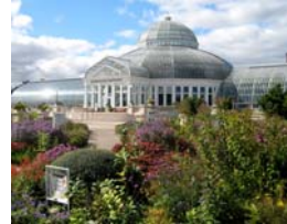
Como Conservatory Special Recreation Feature St. Paul