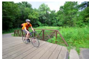
Battle Creek Regional Park Ramsey County