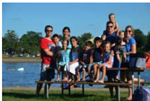
Lake Elmo Park Reserve— Washington County