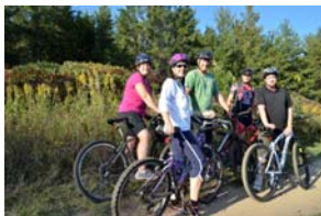
Lebanon Hills Regional Park— Dakota County

Require local comprehensive plans to conform to the policy plan