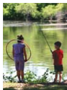
Cedar Lake Farm Regional Park Scott County