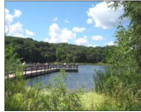
Cottage Grove Ravine Regional Park— Washington County