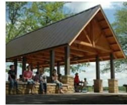
Big Marine Park Reserve Washington County