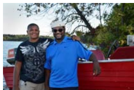
Rice Creek Chain of Lakes Park Reserve Anoka County