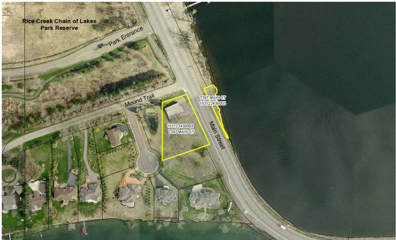
Leibel Parcel 7397 Main Street