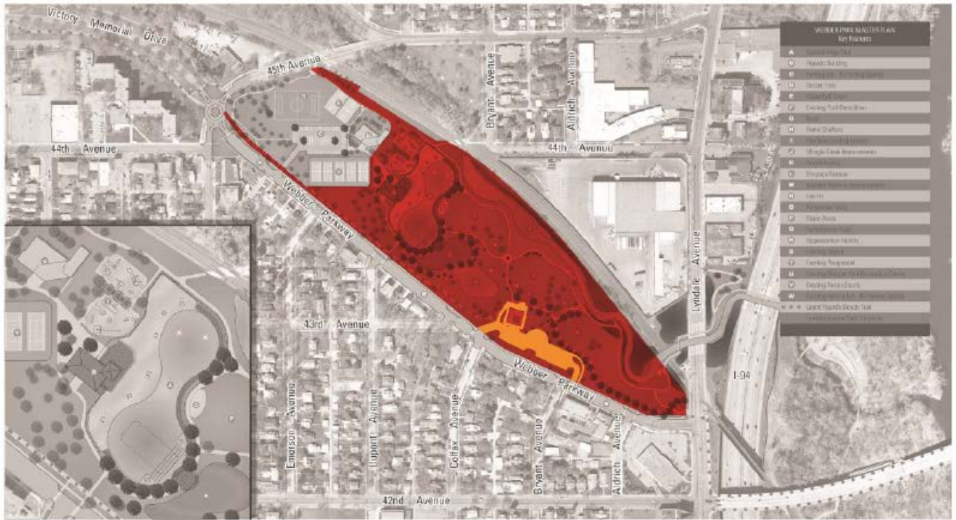
Figure 3: Proposed boundary expansion and easement area

2. Demand Forecast: The expansion of North Mississippi Regional Park will provide continuous regional trail connections, swimming facilities and picnicking opportunities. Trails within Webber Park facilitate continuous connections between Shingle Creek Regional Trail, Victory Memorial Parkway Regional Trail, St. Anthony Parkway Regional Trail and North Mississippi Regional Park. These facilities had the following estimated visits in 2011: