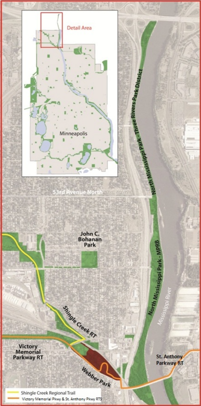
Figure 1: North Mississippi Regional Park Boundary and Expansion Area

Figure 1 shows the boundary of North Mississippi Regional Park; the portion of Webber Park being added to the boundary is shown in brown.