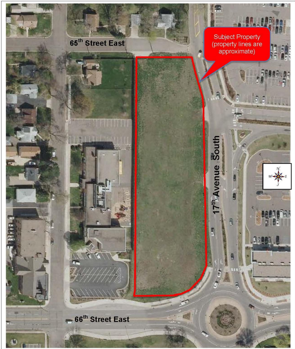
SUBJECT AERIAL PHOTOGRAPH (Subject Property Outline in red from Hennepin Co. GIS)