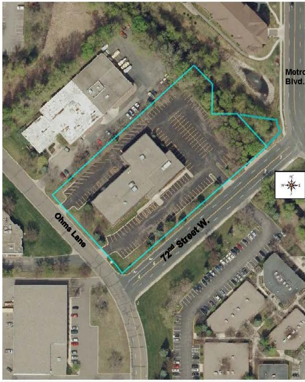
SUBJECT AERIAL PHOTOGRAPH