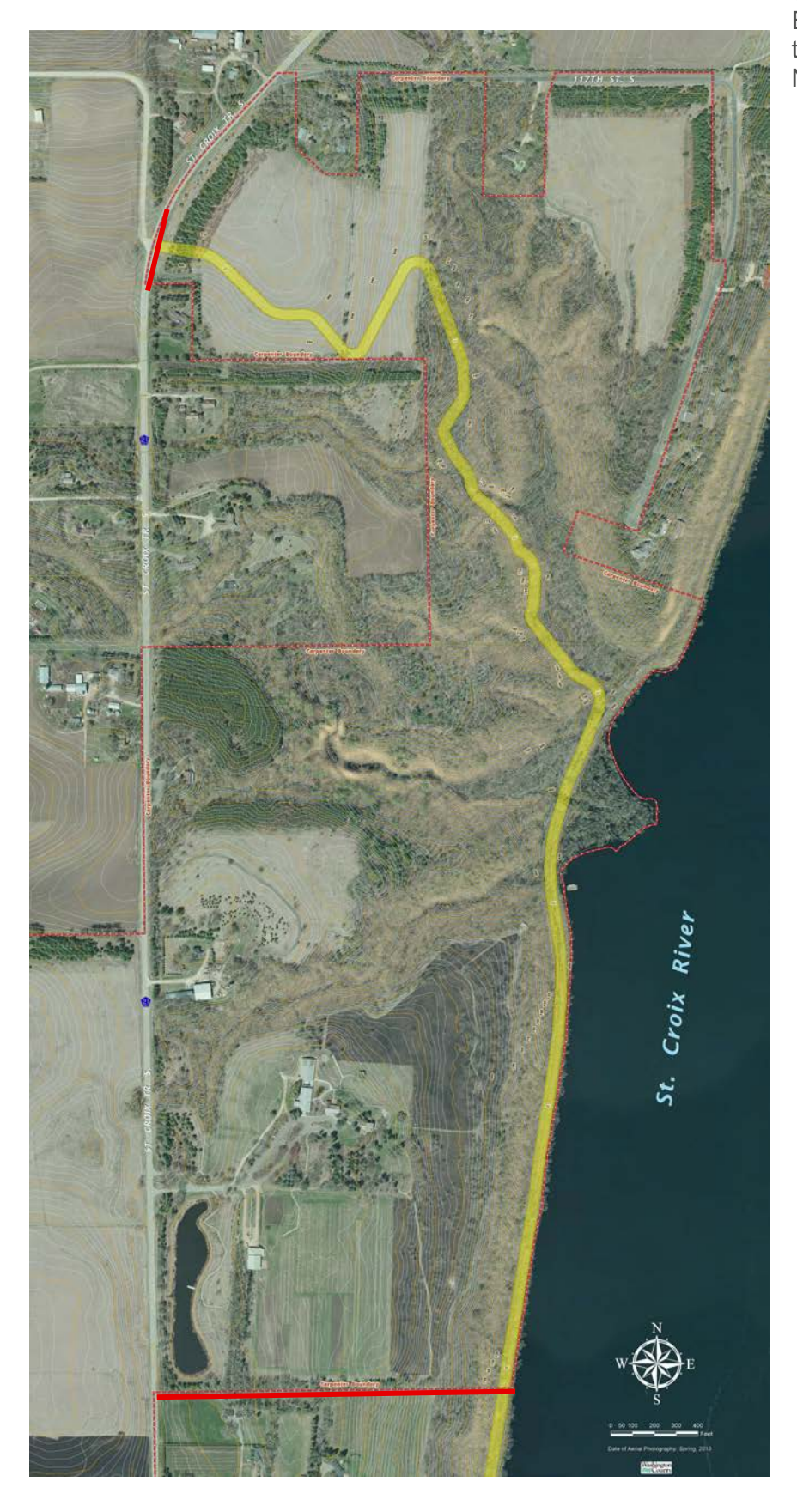
St. Croix Valley Easement through Nature Center