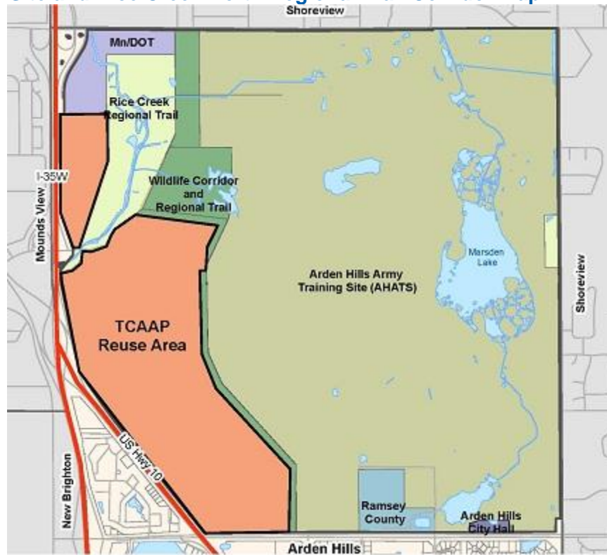
Figure A: TCAAP Site and Rice Creek North Regional Trail Corridor Map

The County has a Joint Powers Agreement with the City of Arden Hills that establishes a partnership with the goal of remediation and productive reuse of the 427 acre site. Redevelopment of the site is anticipated to include a mix of residential, mixed use, retail, and office space. Critical transportation improvements are needed to facilitate redevelopment. These proposed improvements require modifications to land associated with the Rice Creek North Regional Trail corridor.