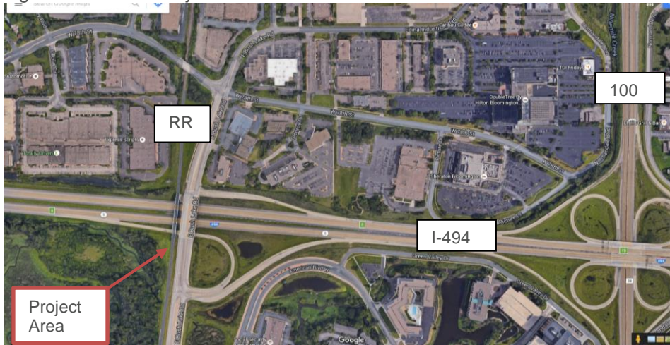
Figure 2: Detailed Project Area