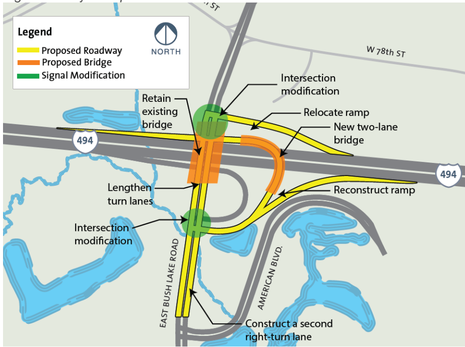
Figure 3: Project Improvements