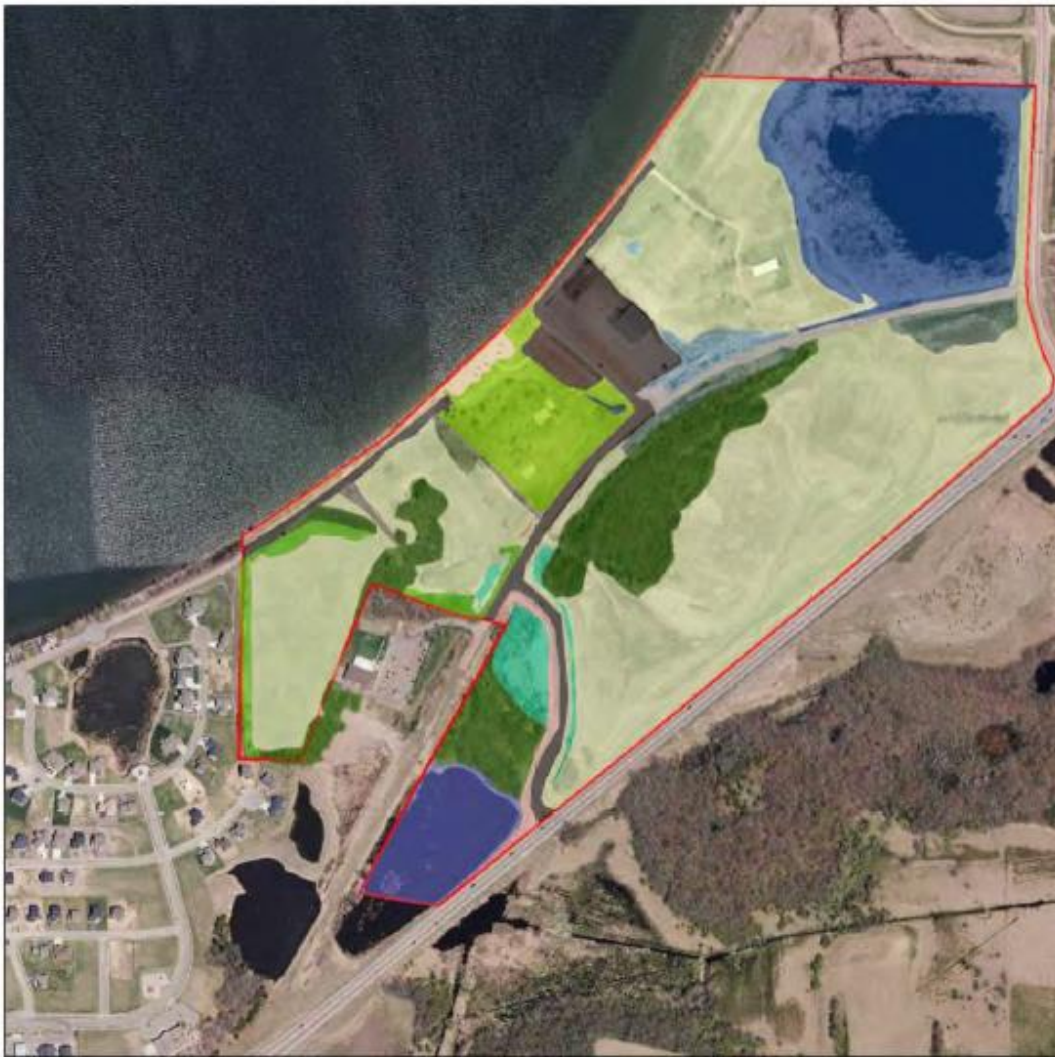
Figure 5: MLCCS Map: Lake Waconia Regional Park Main Park Parcel