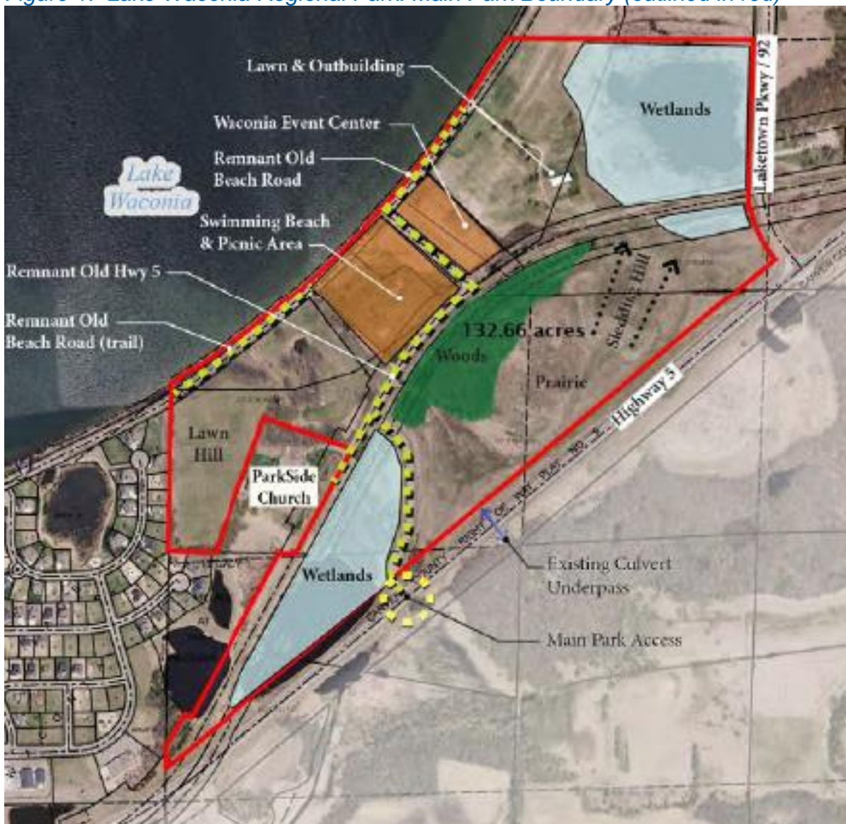
Figure 1: Lake Waconia Regional Park: Main Park Boundary (outlined in red)

Figures 1 and 2 shown the boundaries of the main park parcel and Coney Island outlined in red.