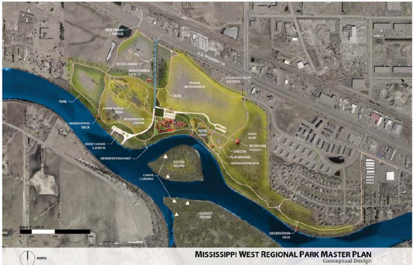
Figure 6: Revised Development Concept for Mississippi West Regional Park

The remaining projects outlined in the 2011 master plan are still planned, although the phasing timeline has changed. Anoka County is planning to construct the majority of the infrastructure including roads, parking lots and trails, one to two picnic shelters, a restroom, a playground, and a maintenance facility within the next five to ten years. The remaining picnic shelters, restrooms, visitor center, and other facilities identified in the 2011 master plan will be implemented in the next 15-20 years as funding allows. The revised development concept is shown in Figure 6.