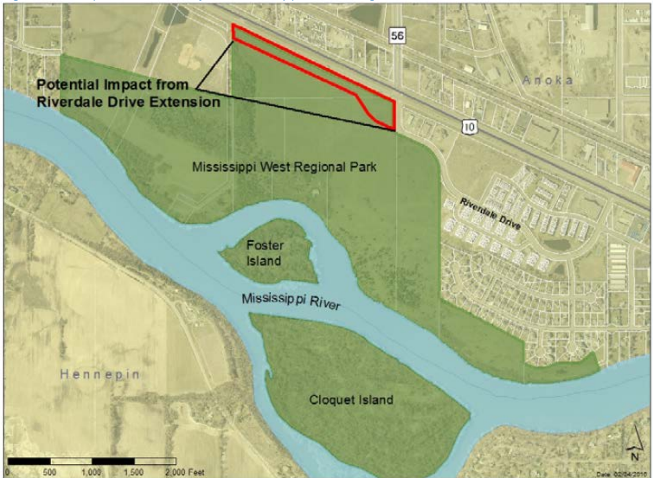
Figure 1: Proposed Boundary of Mississippi West Regional Park

There are no parcels proposed to be acquired for the regional park, so there are no acquisition costs. If the master plan amendment is approved, the regional park will consist of approximately 268 acres. The proposed boundary of Mississippi West Regional Park is shown in Figure 1.