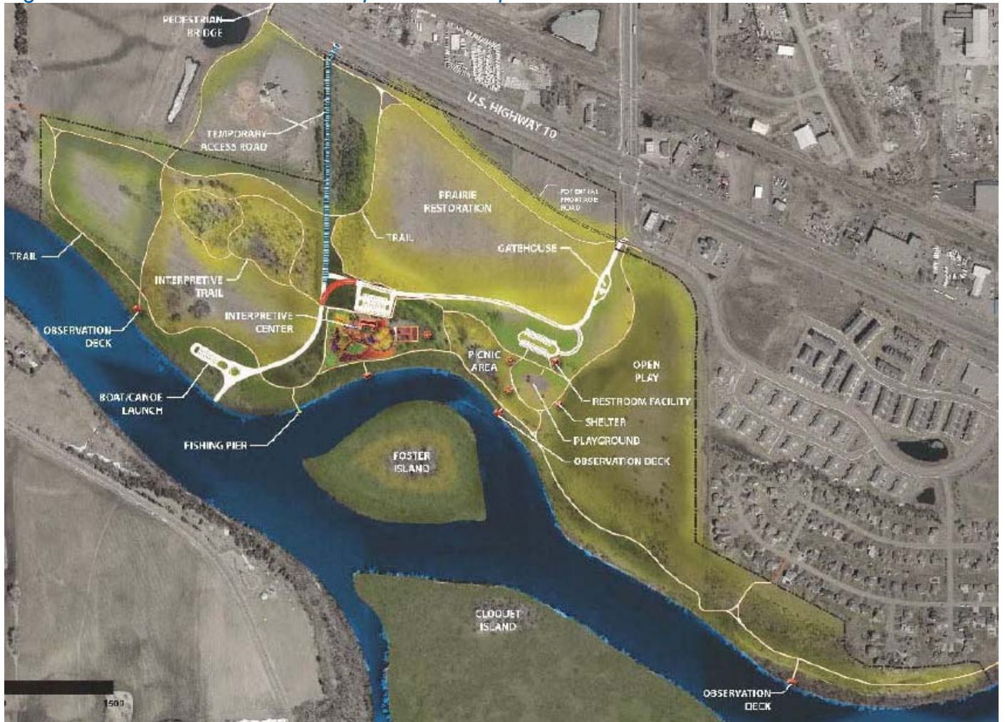
Figure 2: 2011 Master Plan Development Concept

Development of a gravel roadway, boat launch and an associated paved parking lot, trails, and two observation points has occurred since 2011. These improvements are shown on Figure 3.