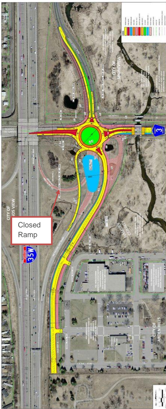
Figure 3: Project Improvements