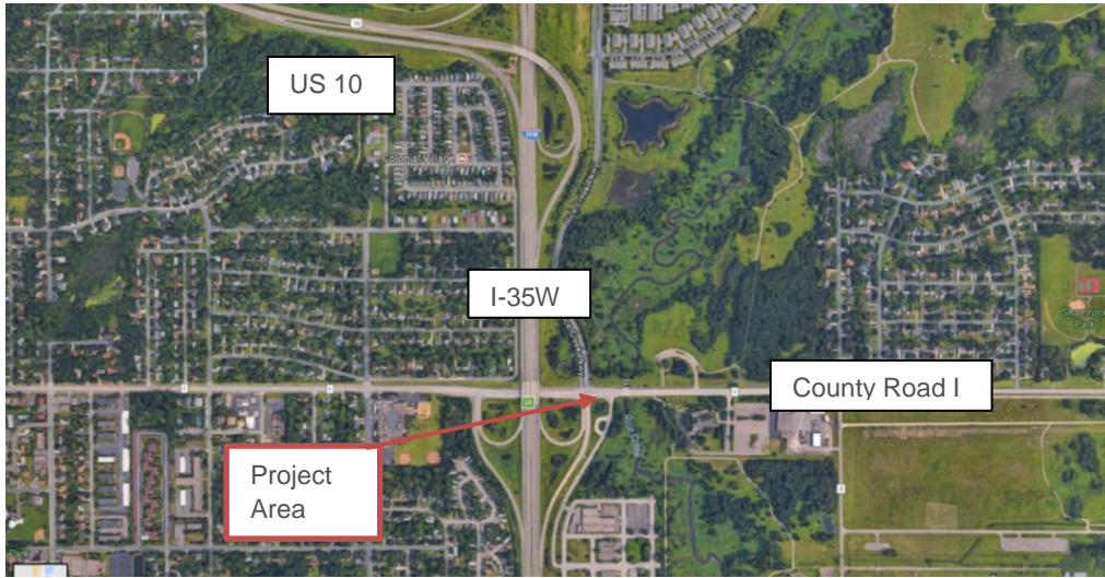
Figure 2: Detailed Project Area