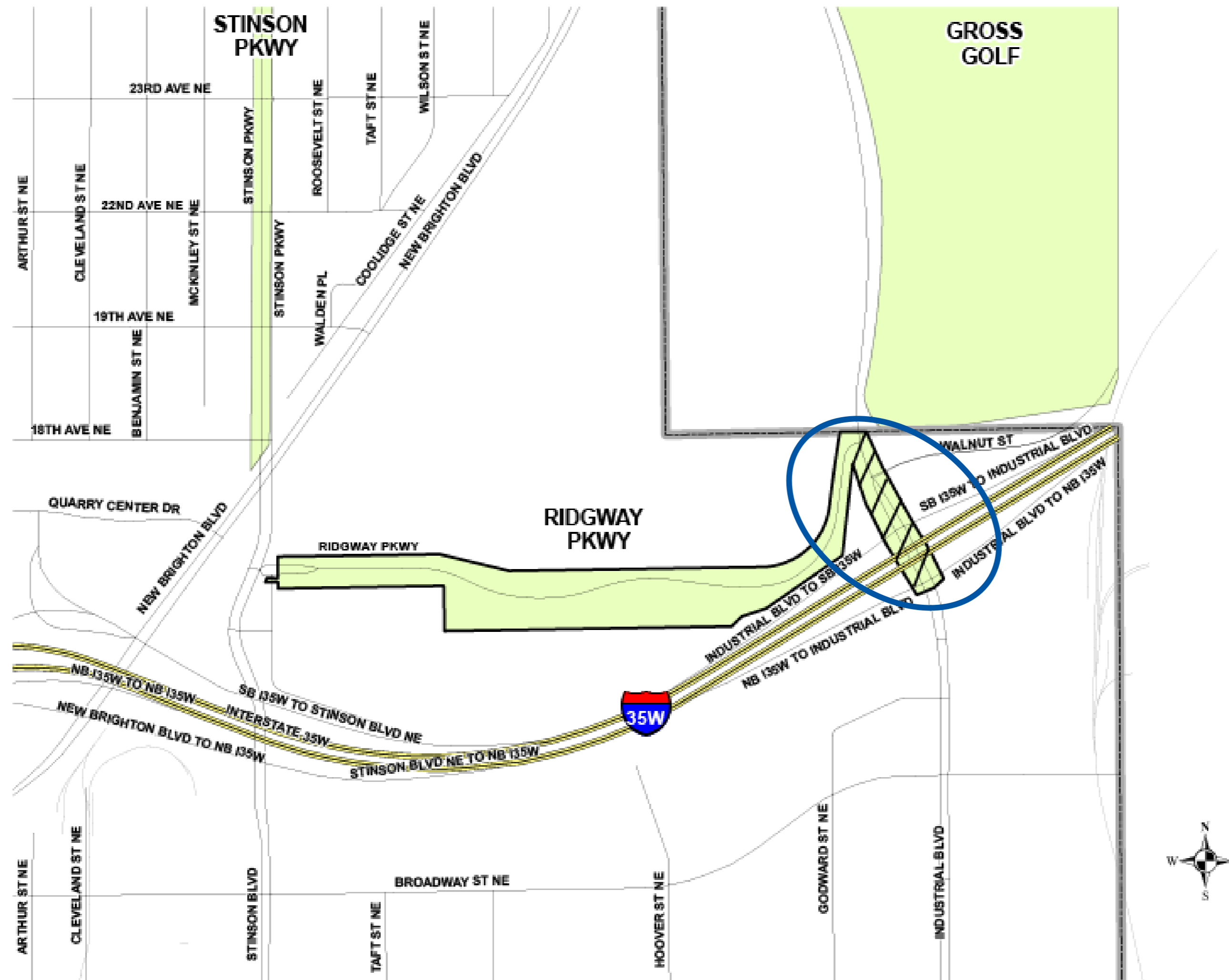
Figure 1 – Ridgway Parkway Regional Trail boundary