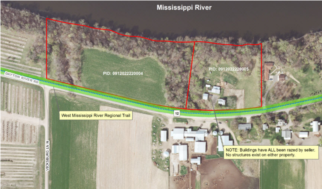
Exhibit 2: Images