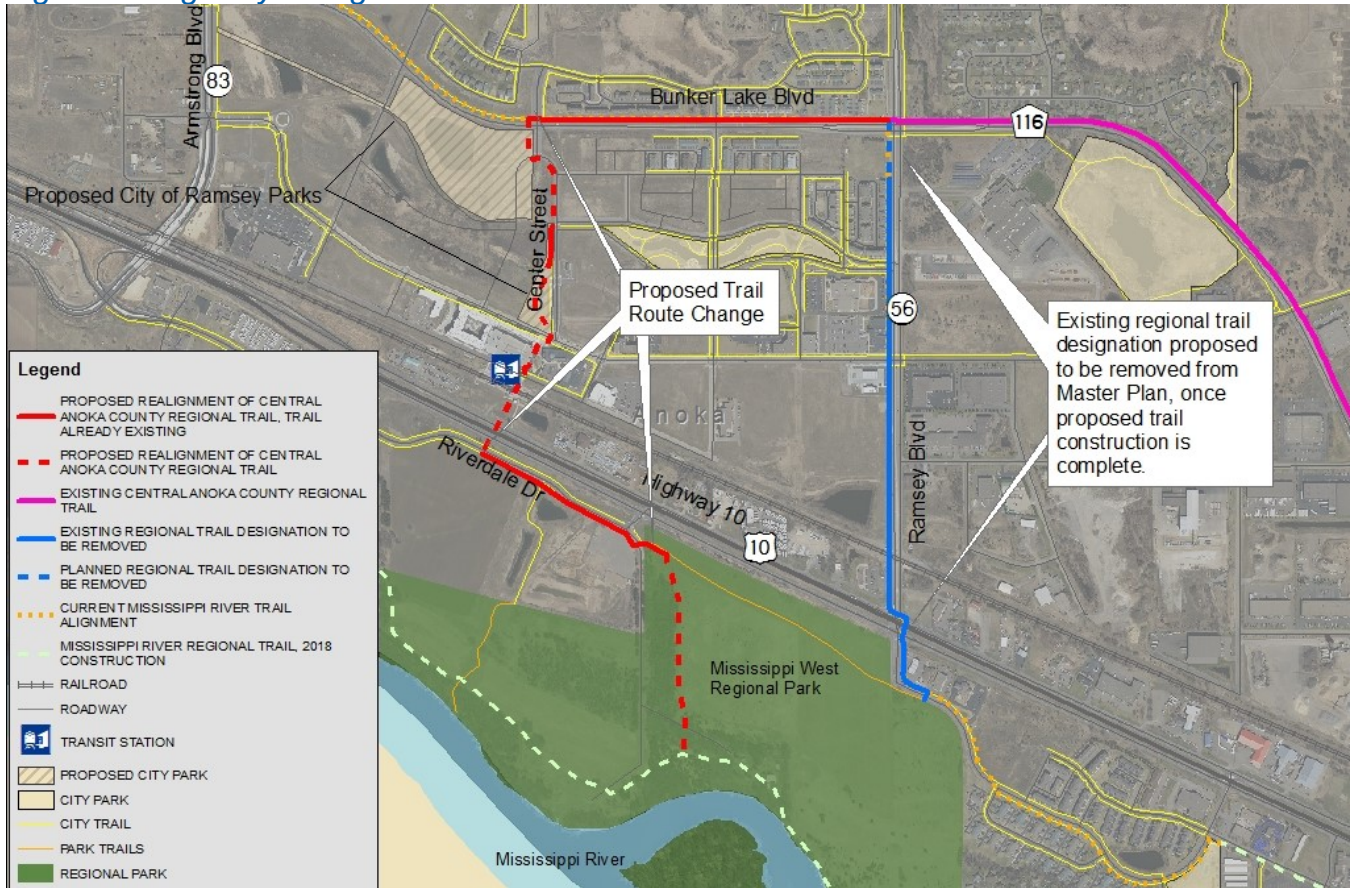
Figure 1: Highway 5 Regional Trail Route

The current alignment of the Central Anoka County Regional Trail follows Ramsey Boulevard south into Mississippi West Regional Park. This amendment proposes to shift the trail about one-half mile west to Center Street in the City of Ramsey. A section of the proposed trail realignment already exists within the road right of way and where the trail does not currently exist, the City of Ramsey owns the right of way or has an easement for regional trail purposes. The value of this easement is approximately $100,000. Prior to construction of the trail, a Joint Powers Agreement will outline and confirm use of the city owned right-of-way and easements for regional trail use. Therefore, no acquisition costs related to this trail change will be required. Figure 1 shows the alignment of the proposed and existing regional trail alignments.