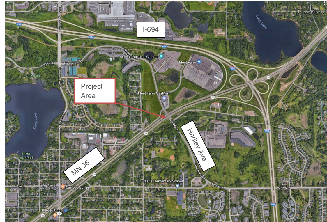
Figure 2: Detailed Project Area