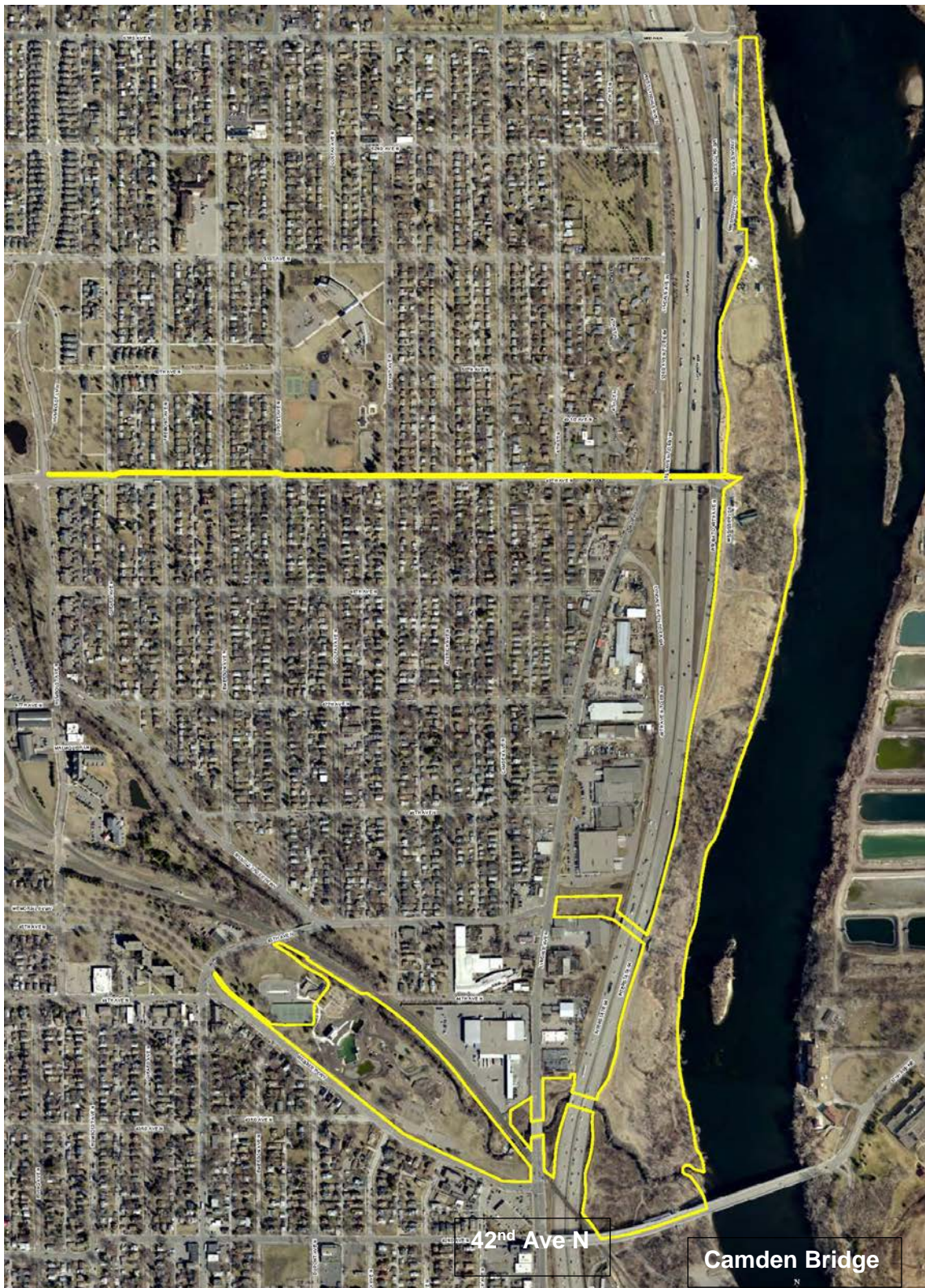
Figure 2. Minneapolis Park and Recreation Board portion of North Mississippi Regional Park Project Map