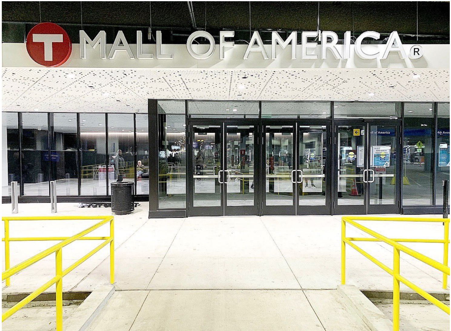
Entrance from Blue Line