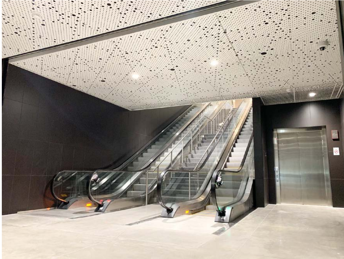
Escalators into the Mall