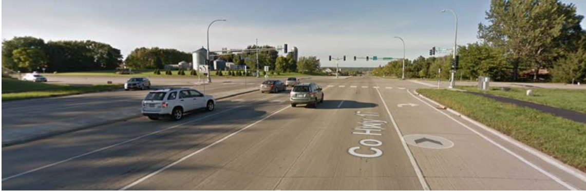
Figure 4: CSAH 17 and CSAH 78 Intersection

CSAH 17 (segment 1358): This north-south segment is a four-lane divided roadway (see Figures 4 and 5) with access controls. At the north end, the corridor is highly developed with St. Francis Regional Medical Center, commercial/retail, Marschall Road Transit Station, and an interchange with TH 169.