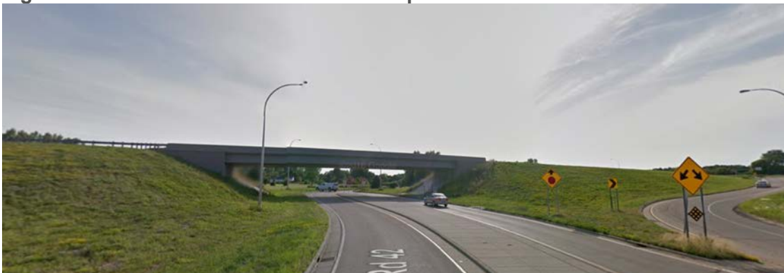
Figure 3: CSAH 42 and CSAH 17 Grade Separation