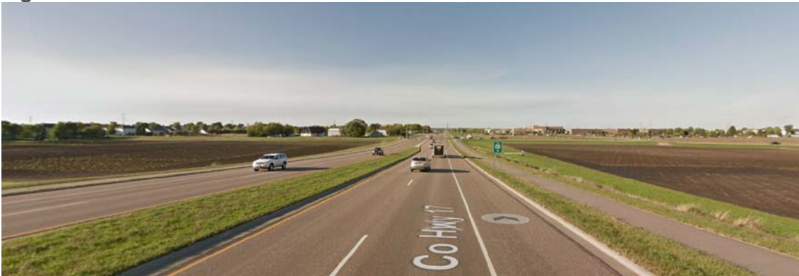
Figure 5: CSAH 17