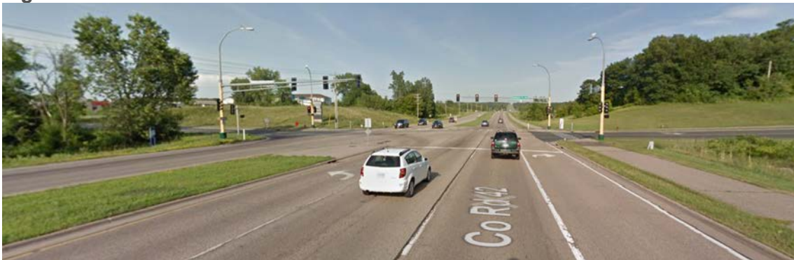
Figure 2: CSAH 42 at McKenna Rd

CSAH 42 (segment 1357): The eastern half of this segment is a four-lane divided roadway (see Figure 2) and the western half will be expanded to a four-lane divided roadway in 2020. CSAH 42 intersects with CSAH 17 with a grade separation (see Figure 3).