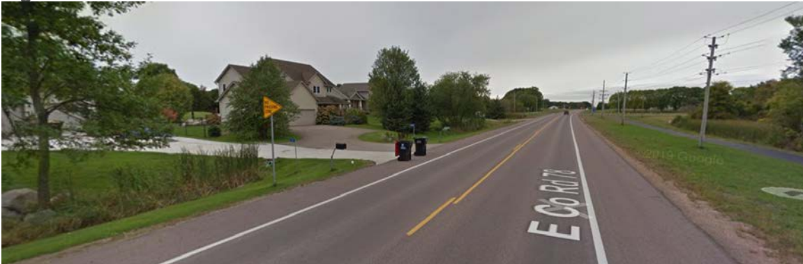
Figure 6: CSAH 78 east of CR 79

CSAH 78 (segment 1359): This east-west segment is a rural, two-lane roadway (see Figures 6-8) with several private accesses throughout the corridor. At the western edge, CSAH 78 will intersect with a new interchange at TH 169 and TH 41 (planned for completion in 2020). This connection with TH 41 facilitates trips to Carver County via a Minnesota River crossing.