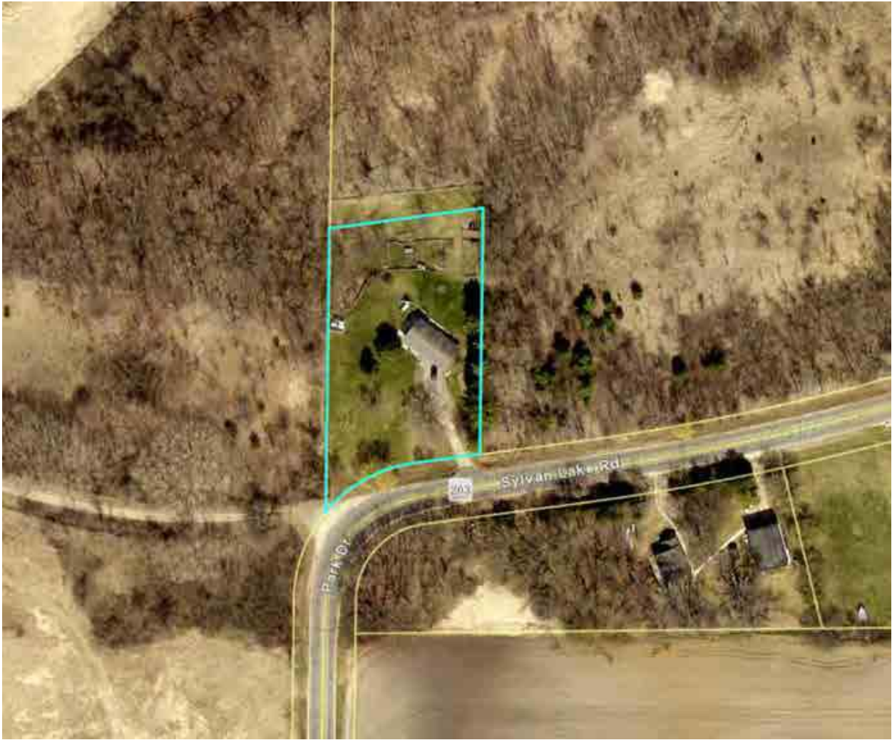
Figure 2: Aerial map of subject property