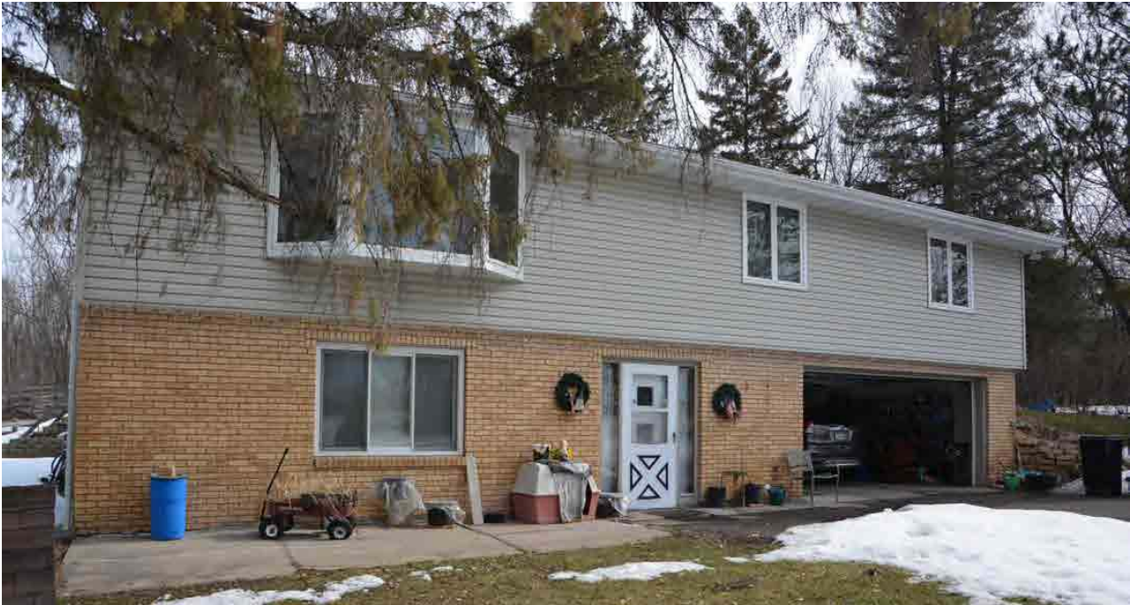
Figure 3: Existing site conditions - Guzek residence