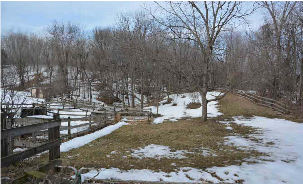
Figure 4: Existing site conditions – Backyard, hobby farm