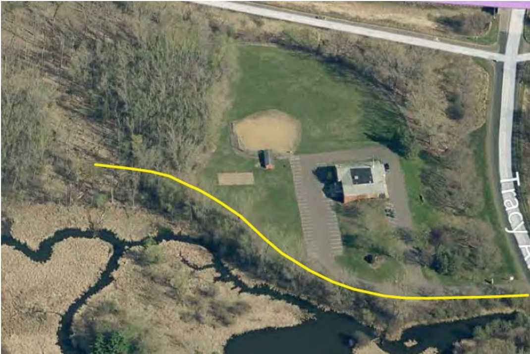
Figure 2: Aerial of church property, with easement shown in yellow and Tracy Avenue to the right