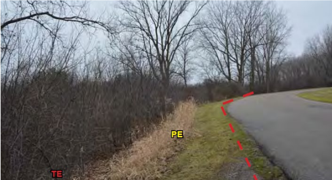
Figure 1: Easement along church driveway (PE: Permanent easement; TE: Temporary easement)