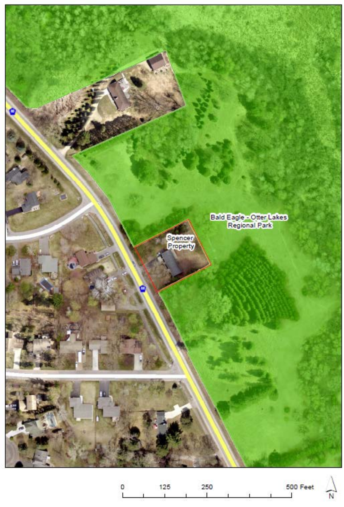
Figure 1. Map of the Spencer property