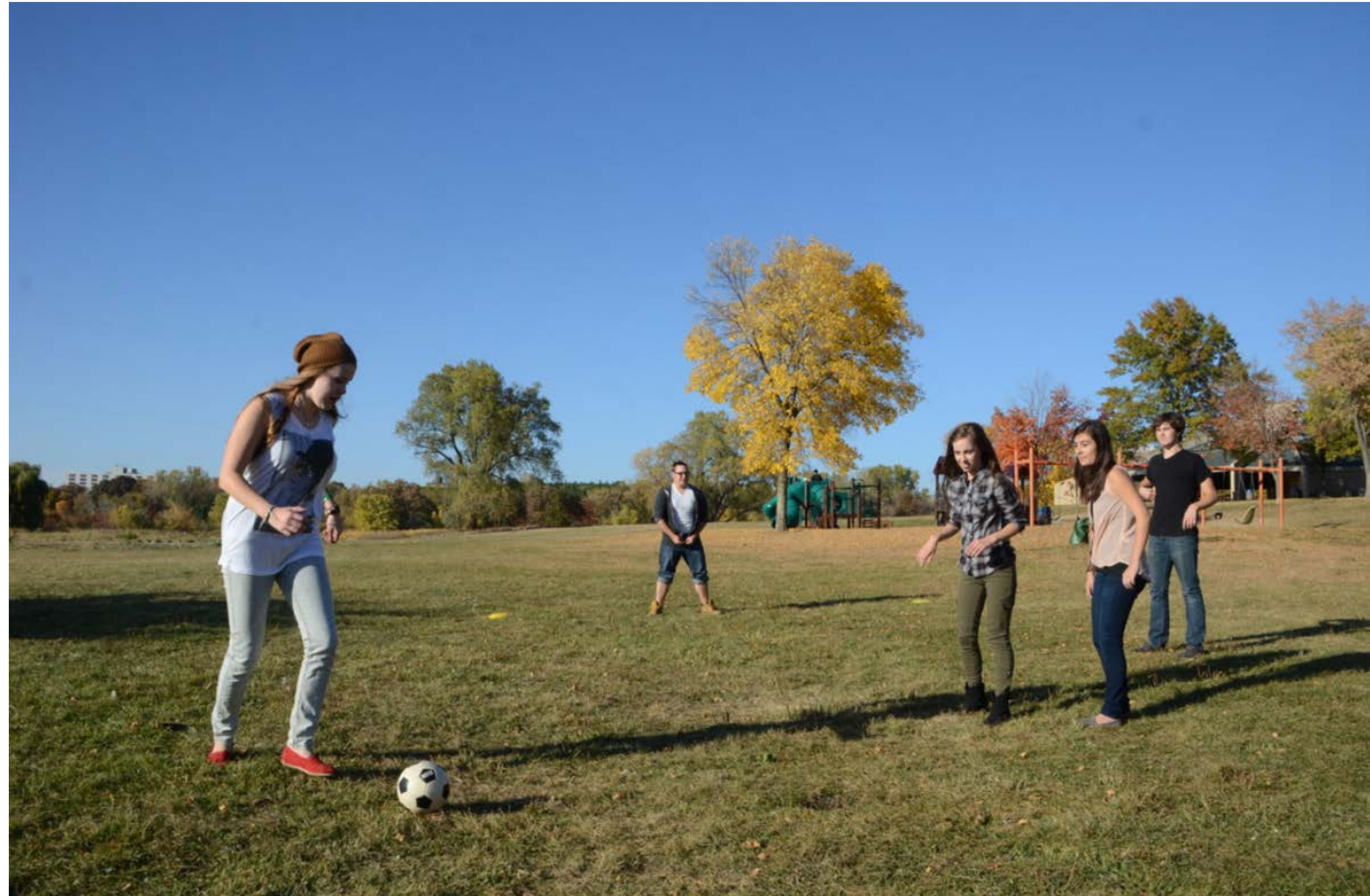
Teens play soccer at Battle Creek - Indian Mounds Regional Park in St. Paul and Maplewood.