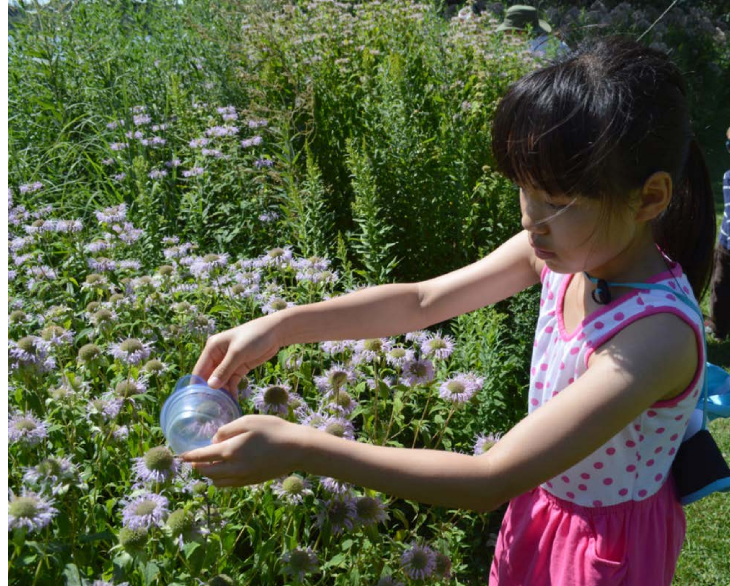
Girl helps with bee survey during a joint Saint Paul Parks & Recreation/U of M program.