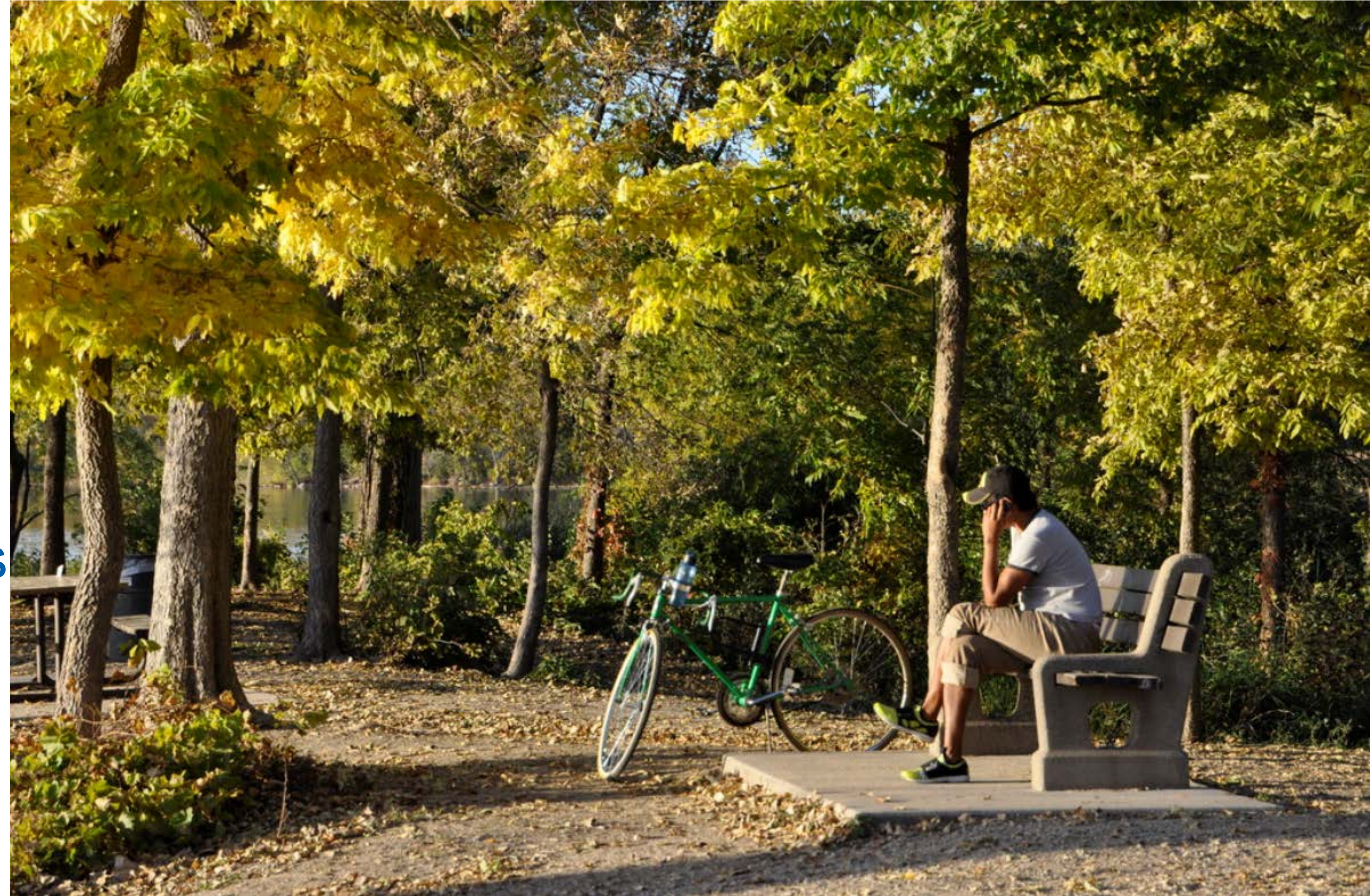
Man on park bench with cell phone near Cedar Lake.