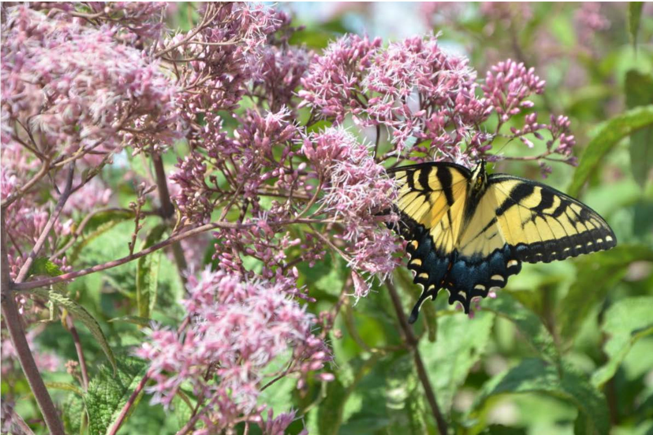
Swallowtail butterfly on joe pye weed.