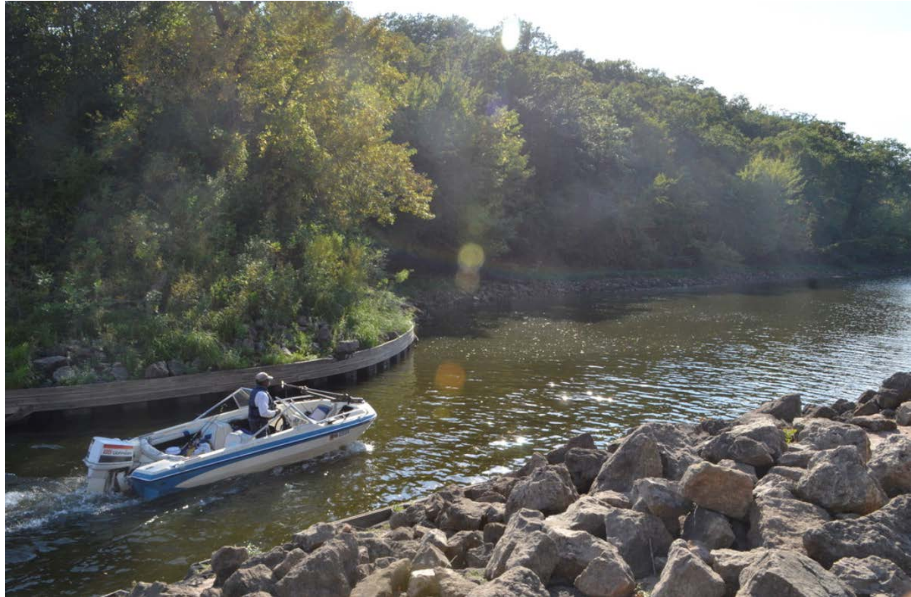
Boat approaches dock and boat landing at St. Croix Bluffs Regional Park.