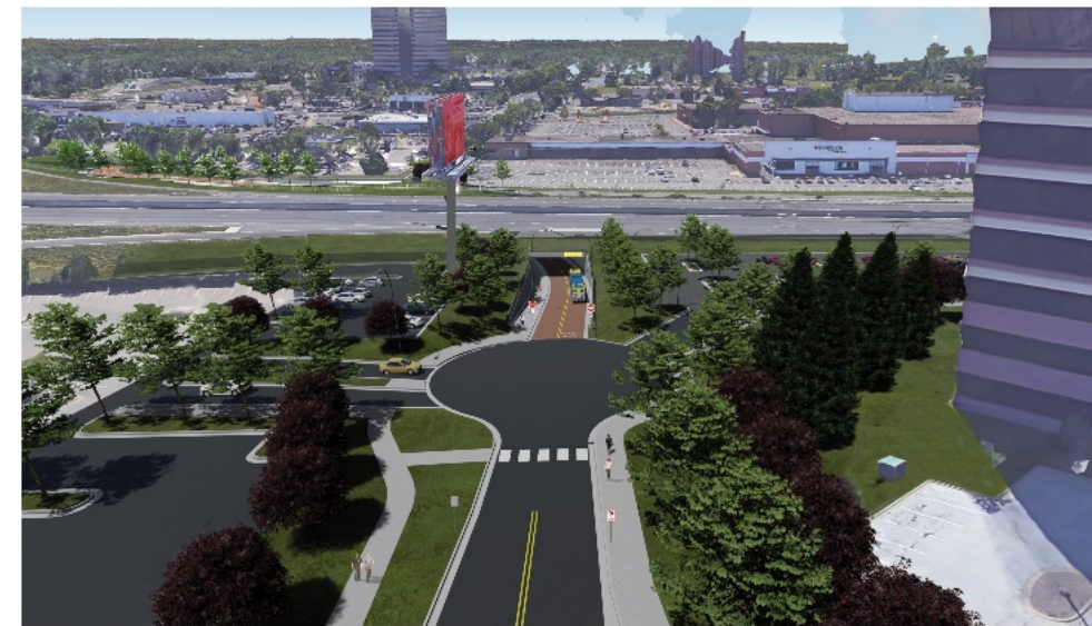
Final Condition Looking south