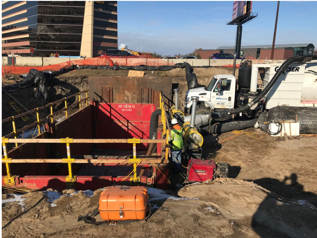
Rice Lake Boring boring 42" Watermain under 494, Fall 2019