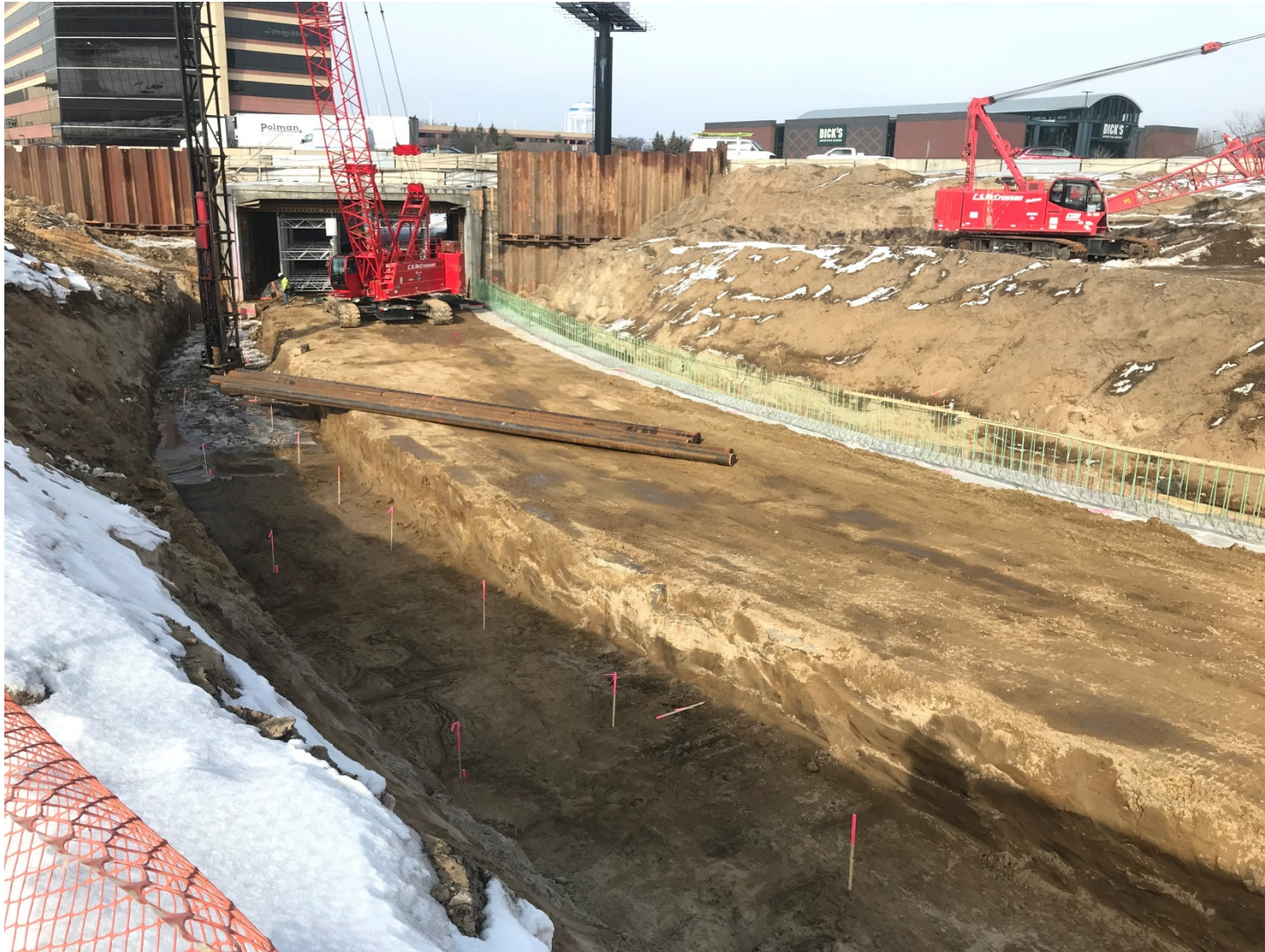
South half tunnel piling west wall, Winter 2021