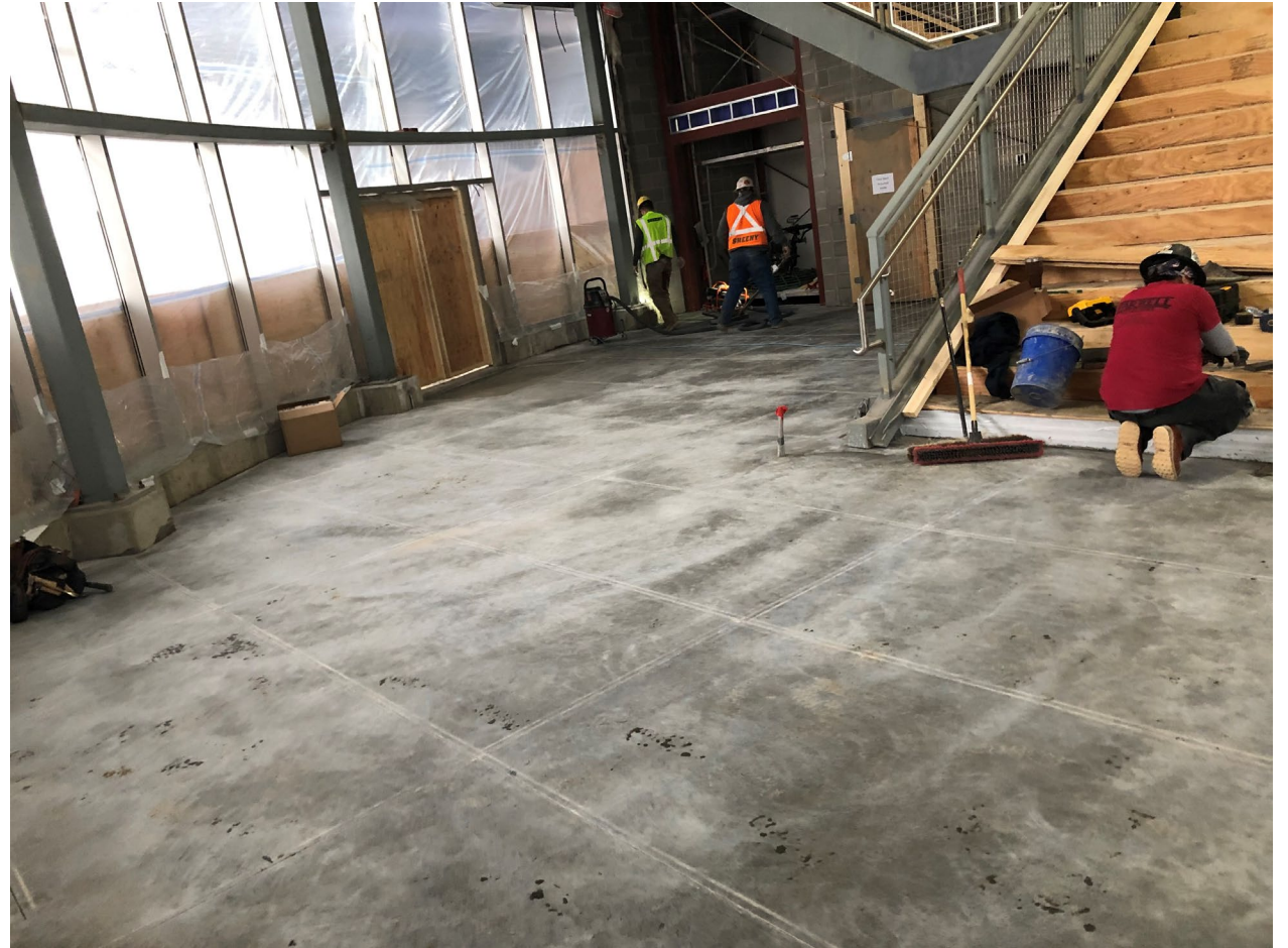
North Station Lobby grand staircase, Winter 2021