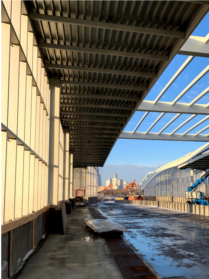
Southbound 35W level loading area, Winter 2021