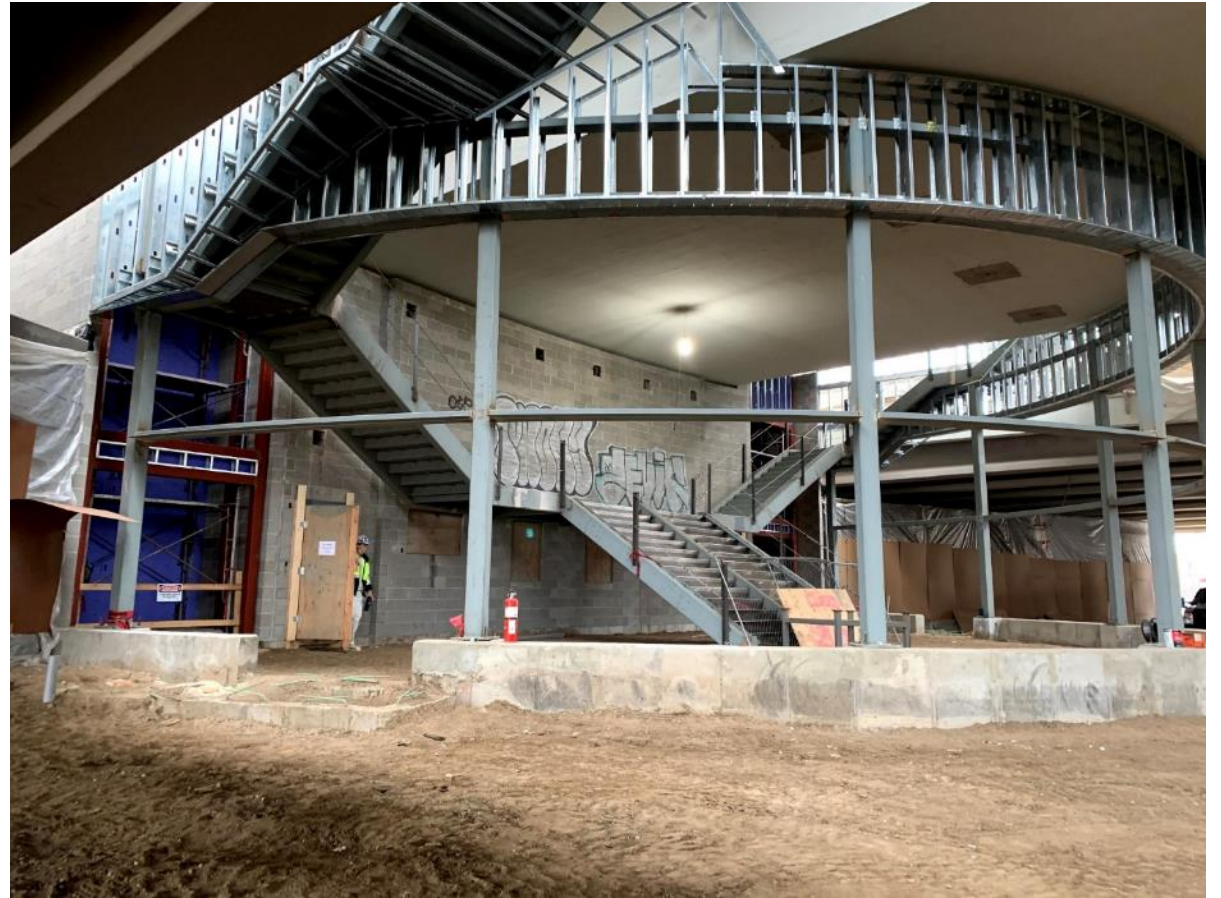
North Station Lobby grand staircase, Winter 2021