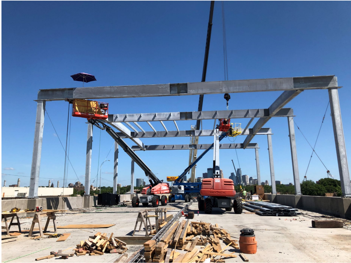
Bald Eagle Erectors Installing Lake Street Canopy, Summer 2020