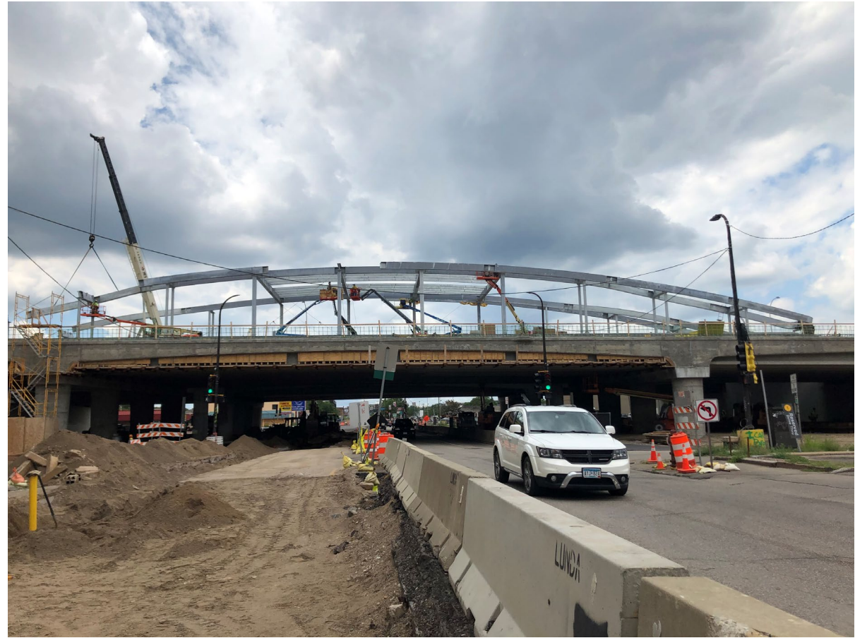
Bald Eagle Erectors Installing Lake Street Canopy, Fall 2020