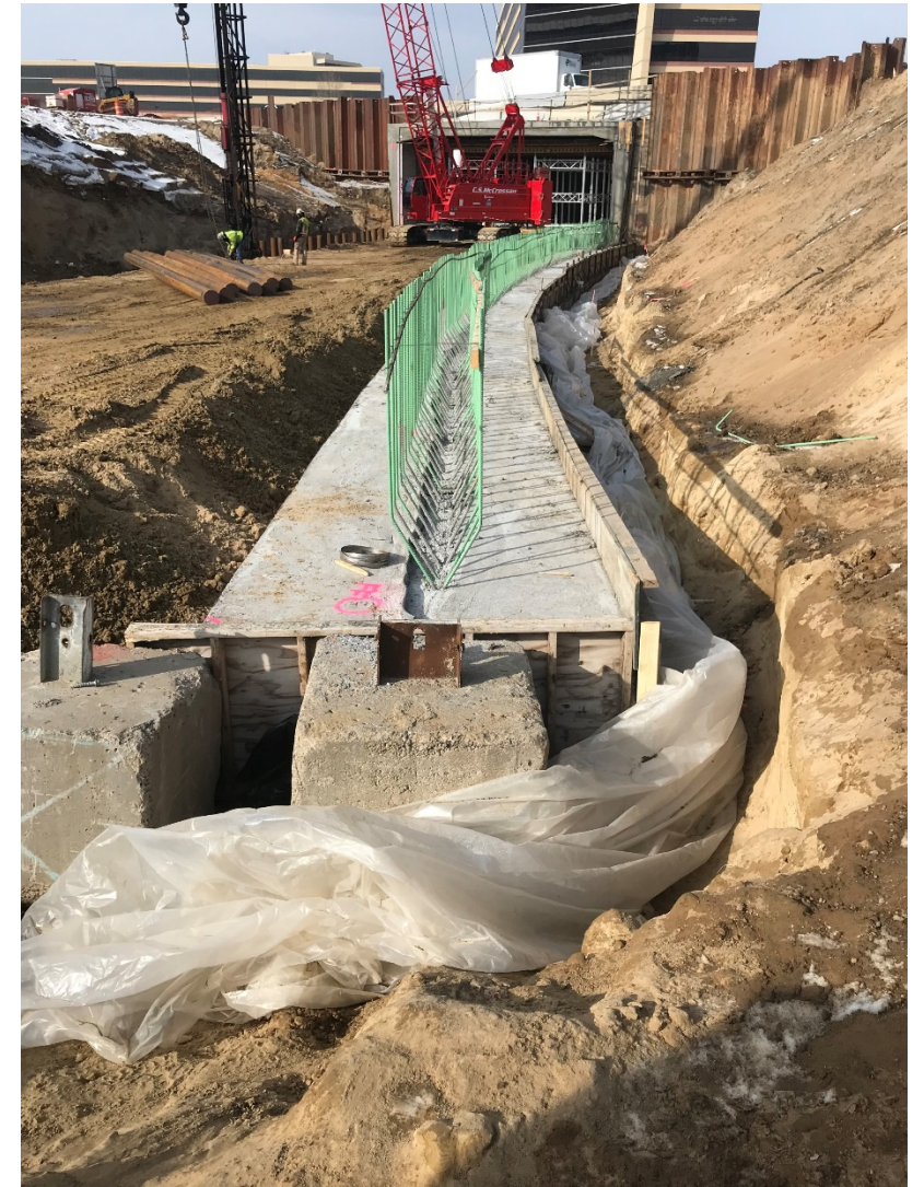
South half tunnel east walls foundation, Winter 2021