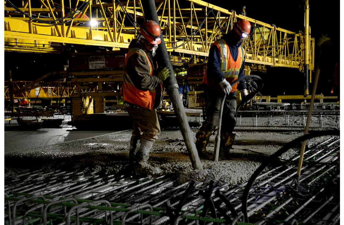
Pouring of the Transit Bridge, Spring 2020