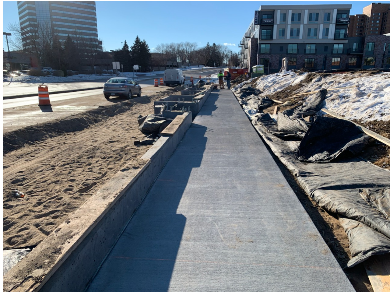
Southbound Knox and American Station utility installation, Fall 2020