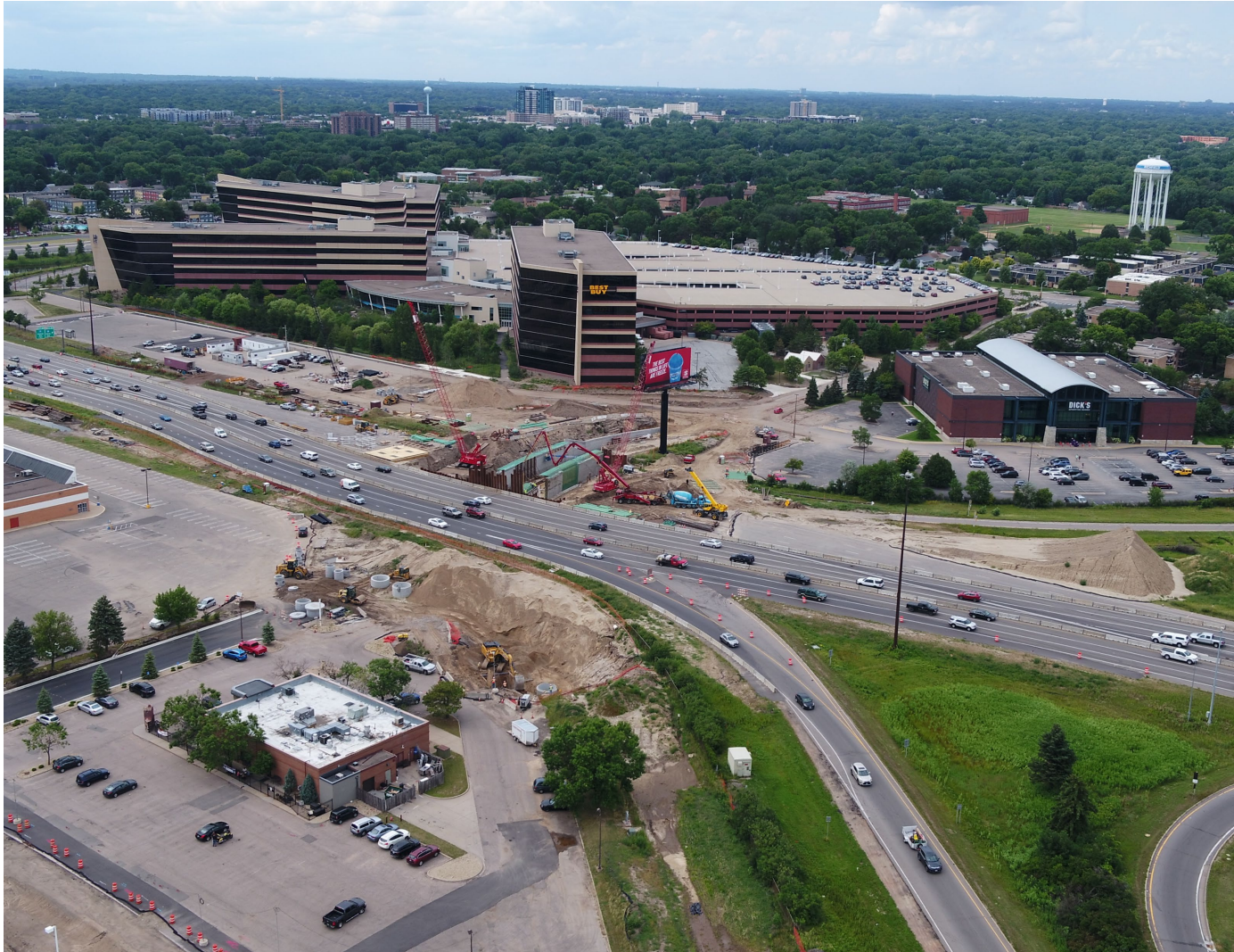
North half tunnel construction, Summer 2020