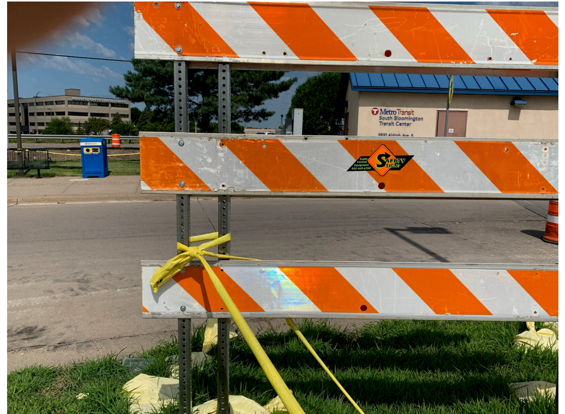
Safety Signs installing signage, Summer 2020