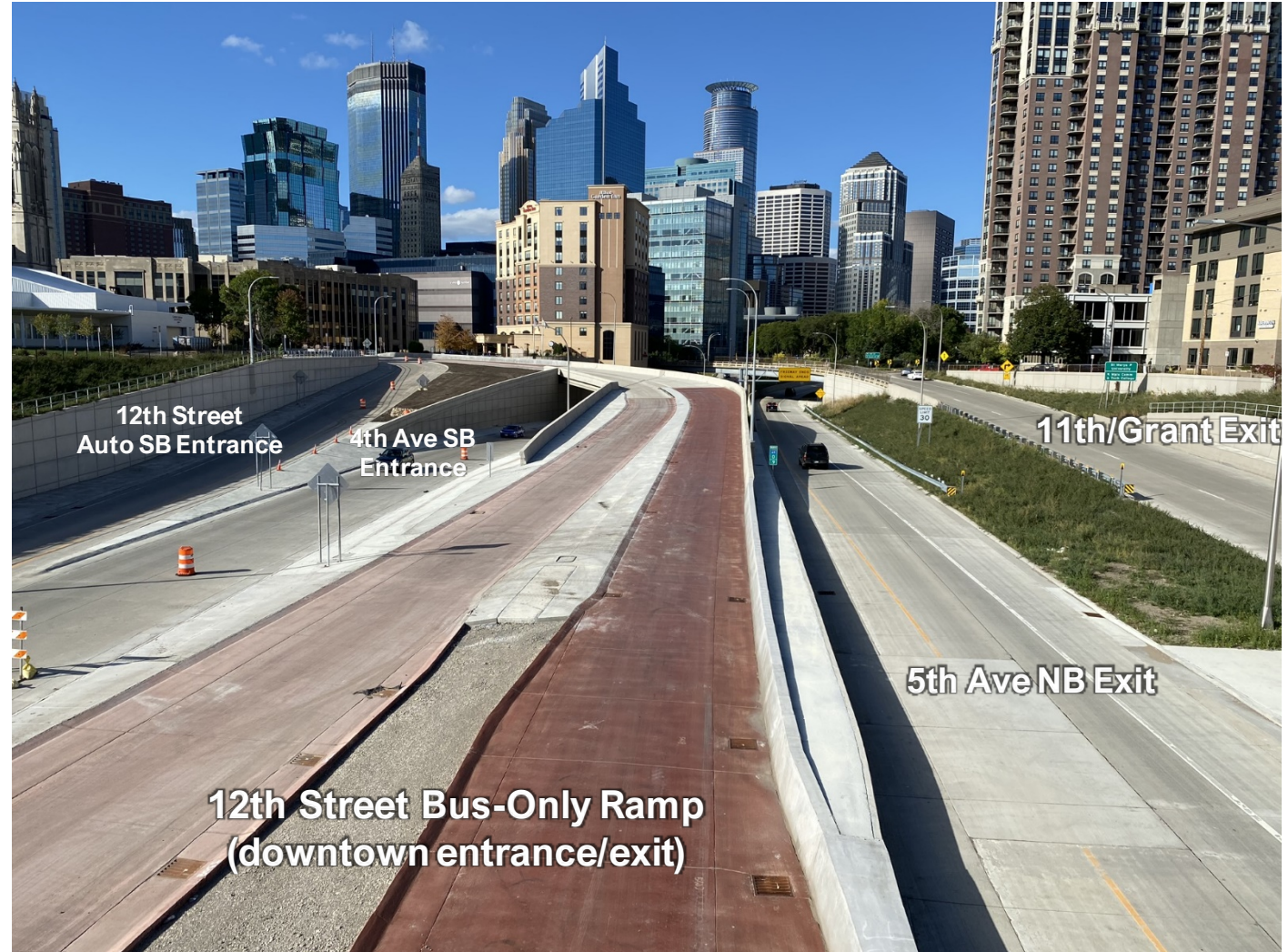
New 12th Street Bus Ramp