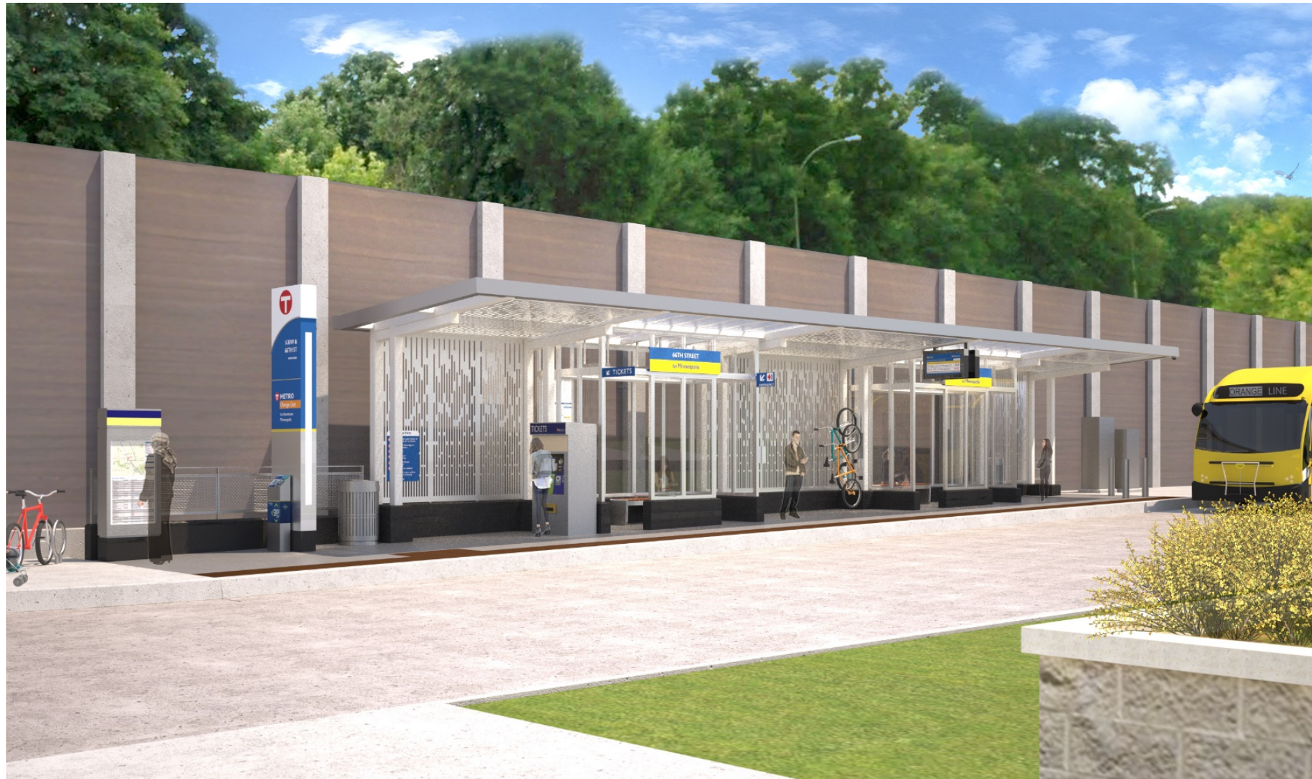
Rendering of future Northbound 66 th Street station