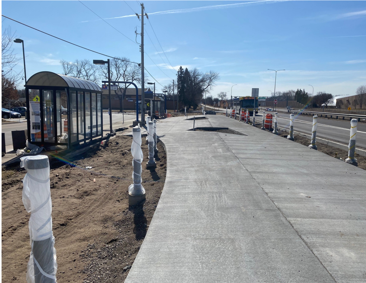
98 th Street Station Plaza, Winter 2020