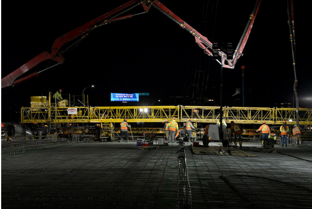
Pouring of the Transit Bridge, Spring 2020