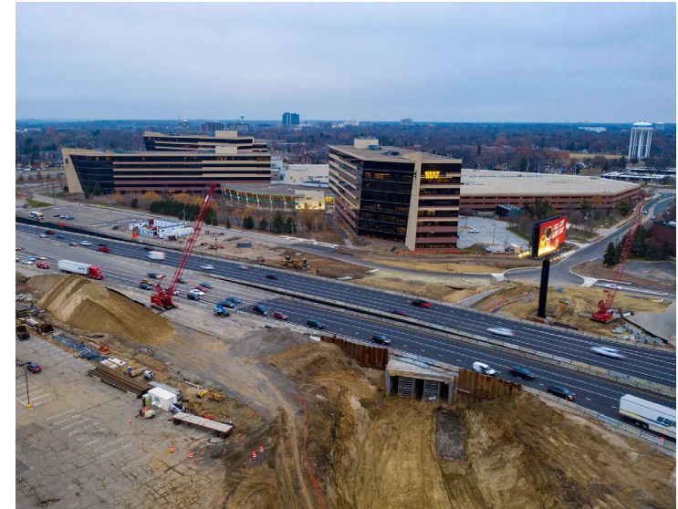
North half tunnel complete, Fall 2020