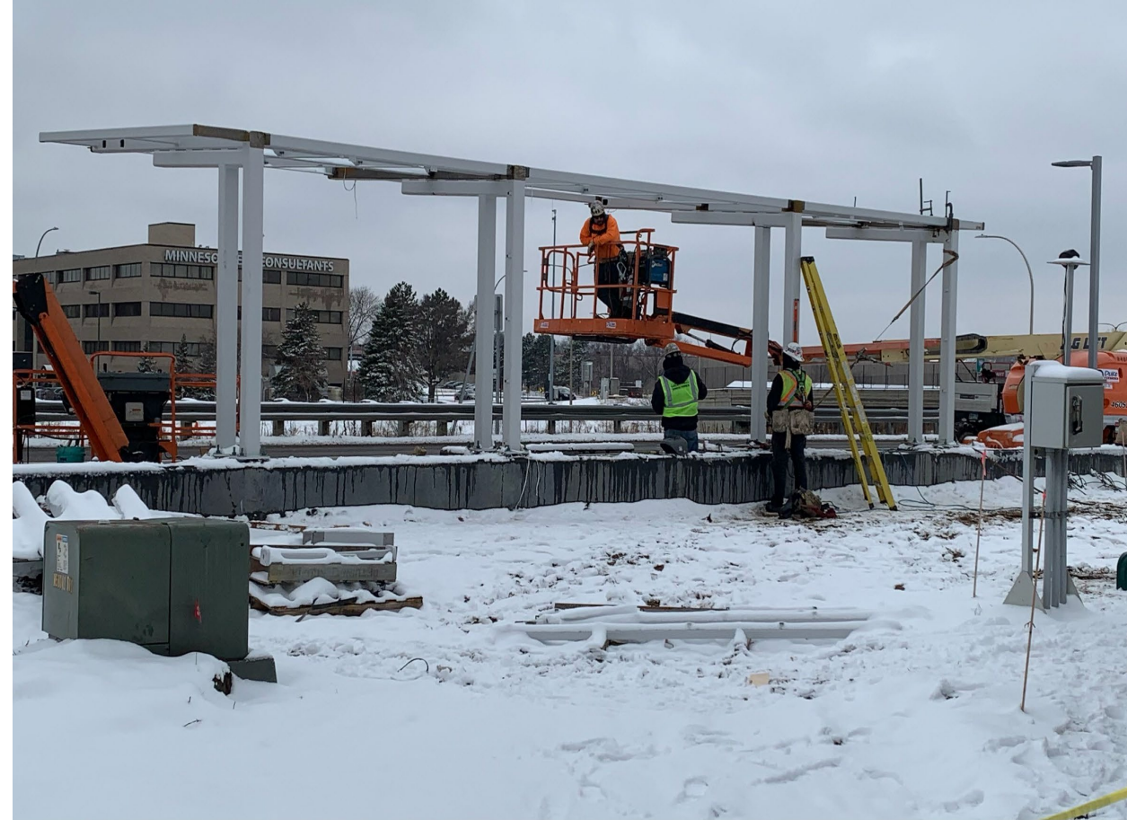
Shelter Erection at 98 th Street, Winter 2020