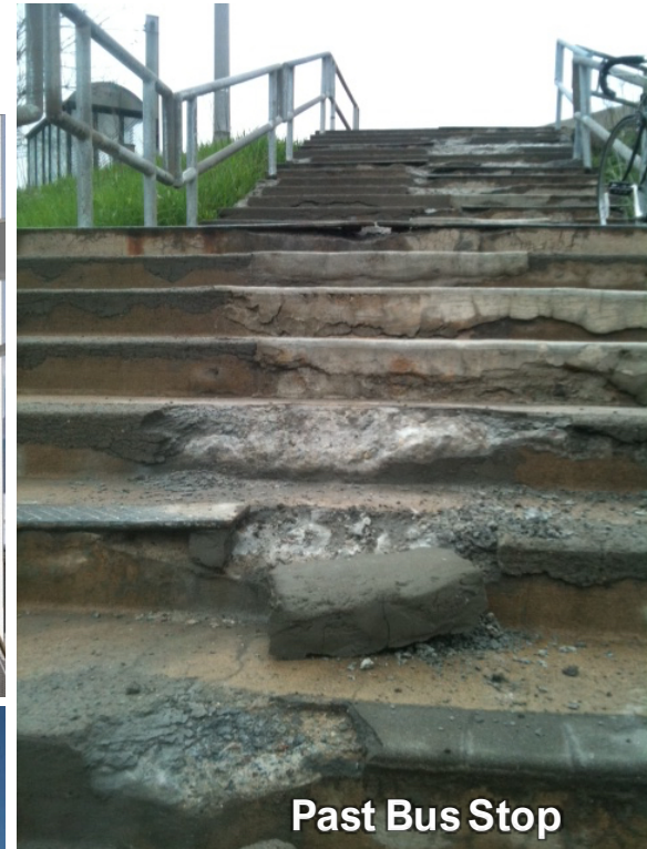
Past Bus Stop