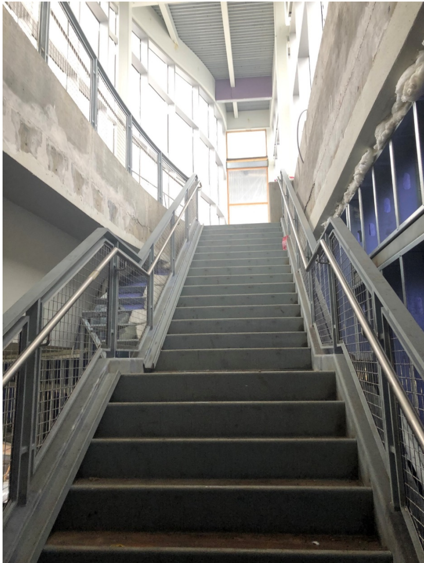
7 Stairs to 35W level from North Station, Winter 2021