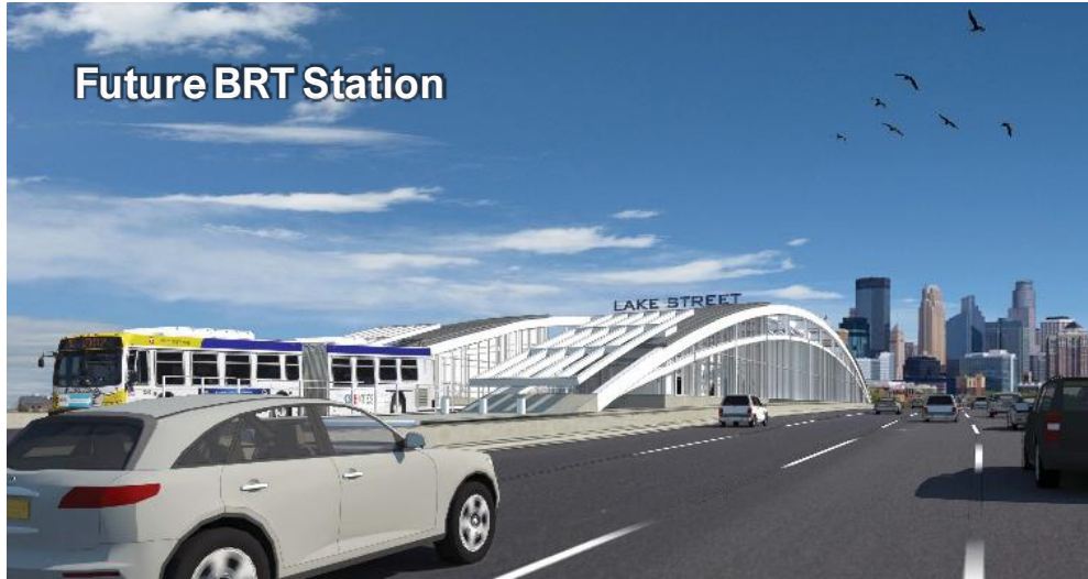
Future BRT Station