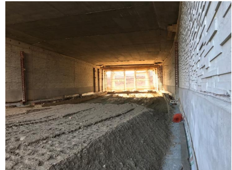
North half tunnel Interior, Fall 2020