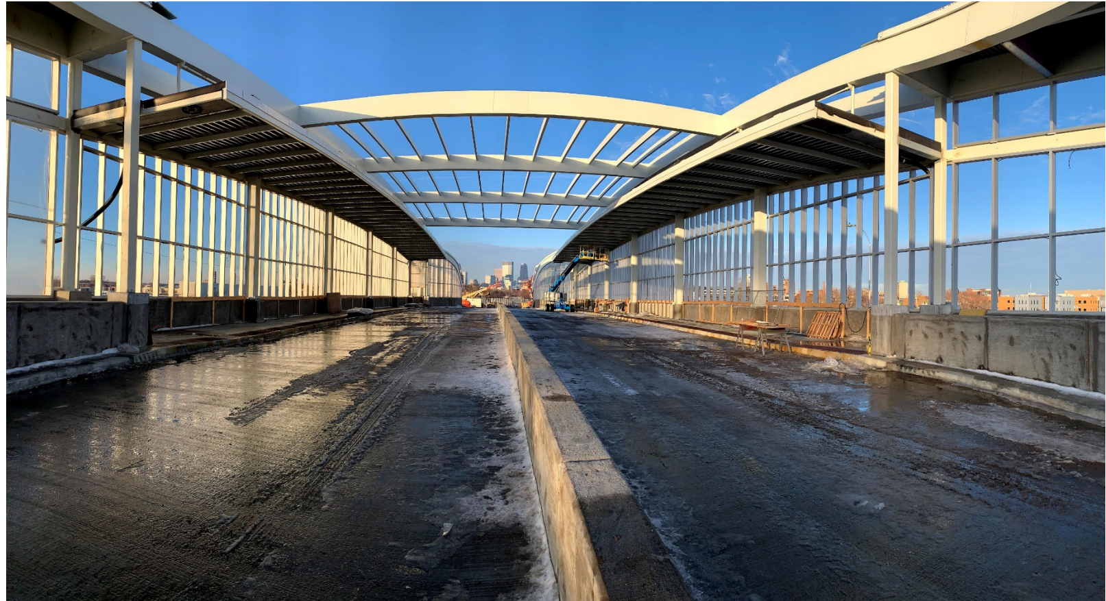
Transit Bridge, Winter 2021