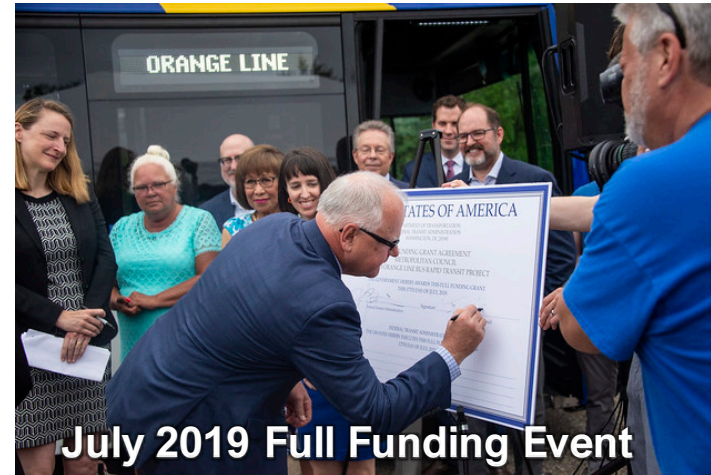
July 2019 Full Funding Event

Next segment of METRO network of LRT & BRT Lines