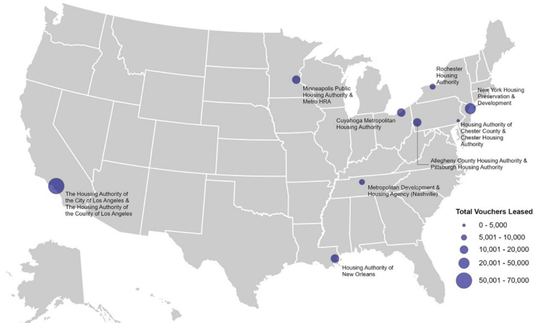
Community Choice Demonstration Sites