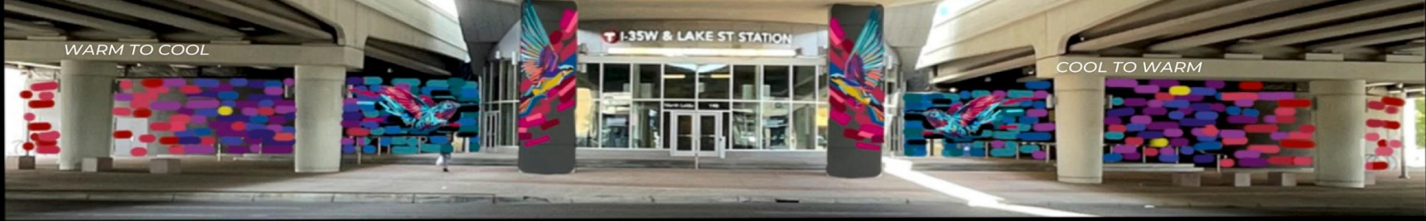
THE DESIGN CONCEPT WORKS WITH THE RAISED PATTERN IN THE HIDE WALLS