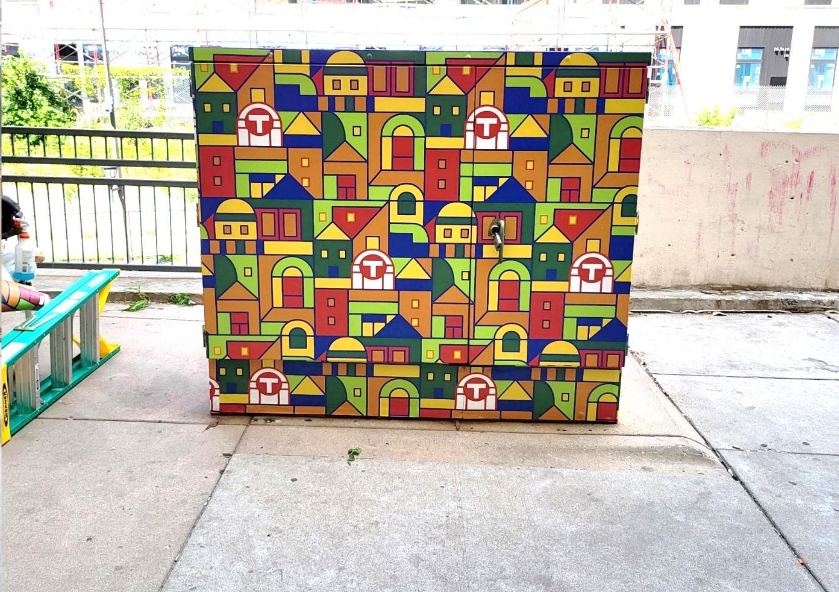
2022 New Public Art Utility Box Wraps