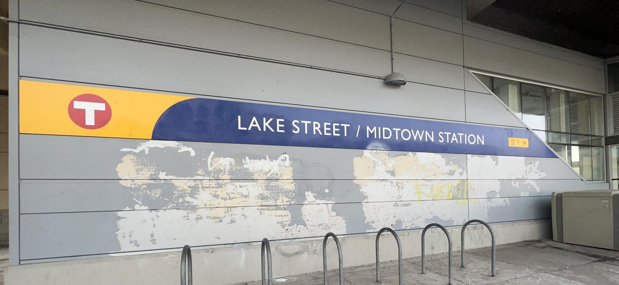
Lake Street Midtown Station Mural Before