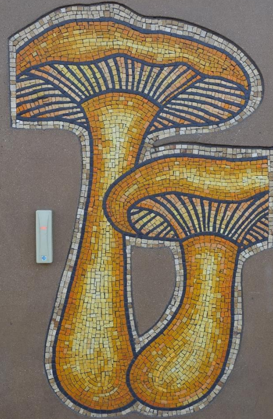
2022 Conservation Projects Mosaic Regrouting – Fairview Avenue Station