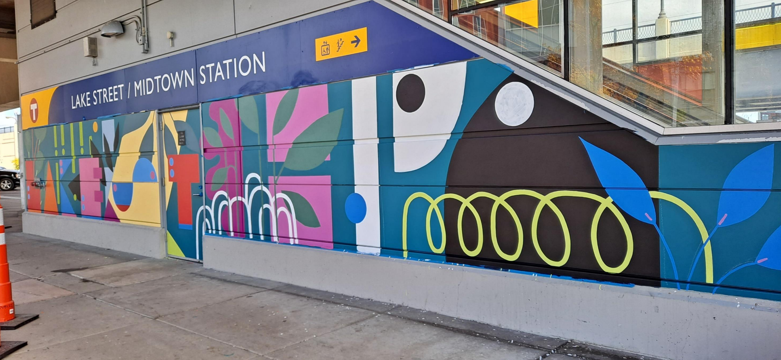
Lake Street Midtown Station Mural After