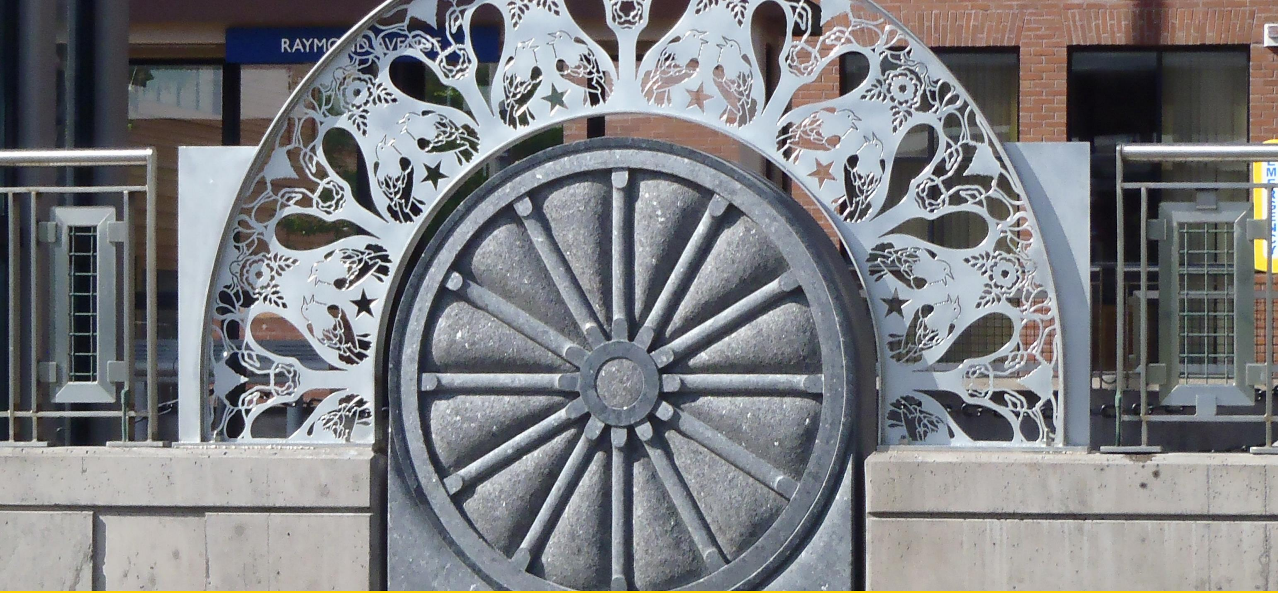
Removal of Rust – Raymond Avenue Station