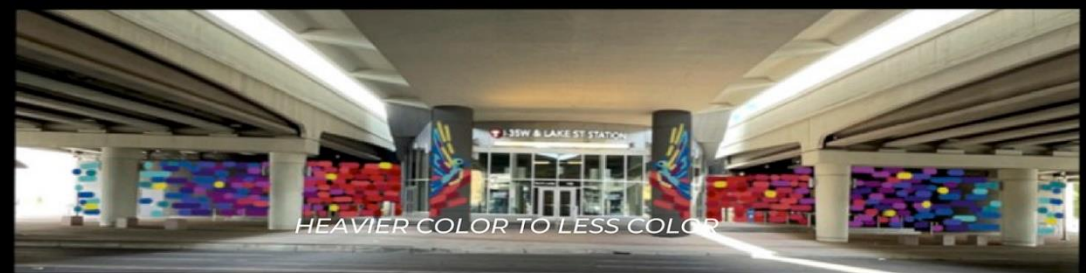
HEAVIER COLOR TO LESS COLOR