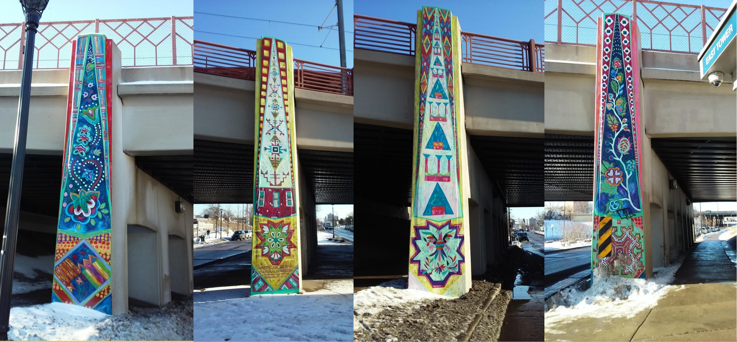
Mural Repair - Franklin Avenue Station