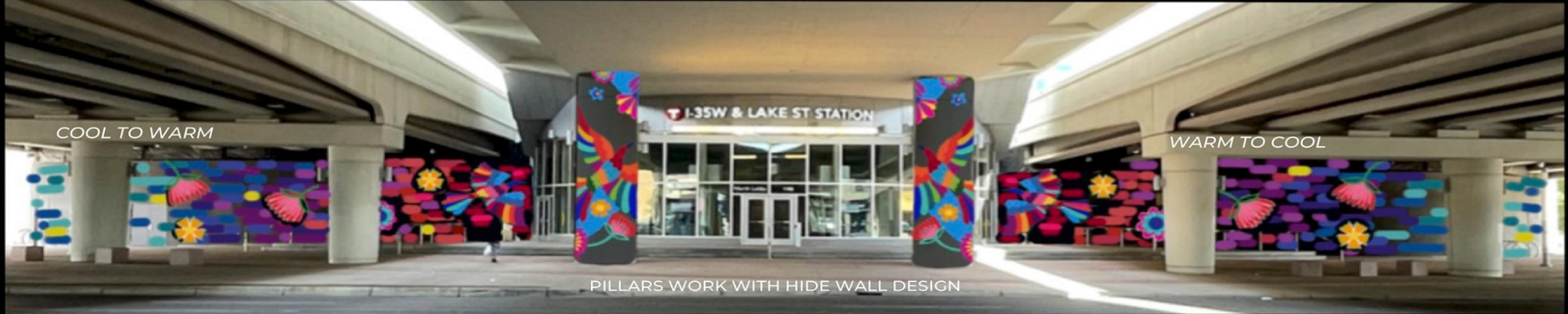
PILLARS WORK WITH HIDE WALL DESIGN