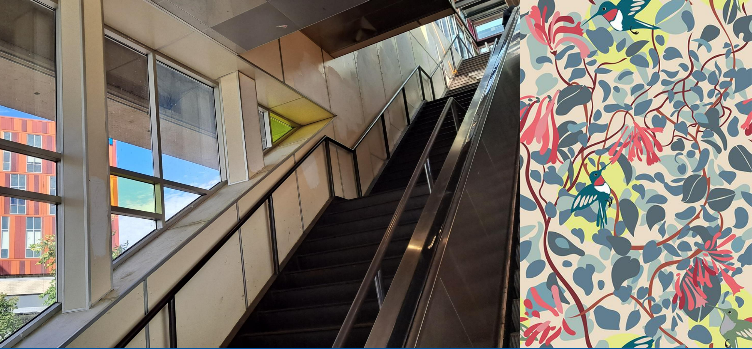
Lake Street Midtown Station Anti-Graffiti Graphics