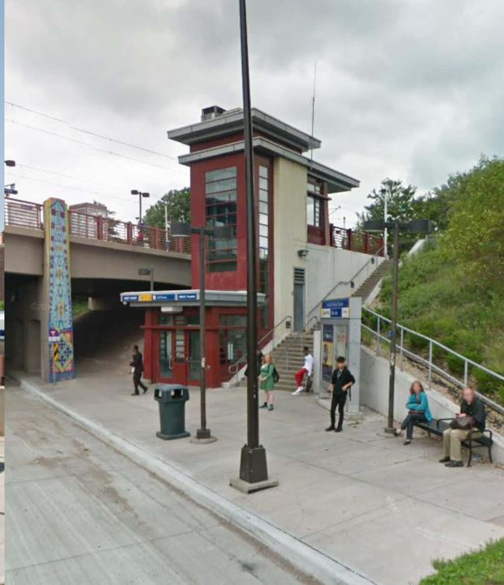
Franklin Avenue Station Mural Partnership with NACDI