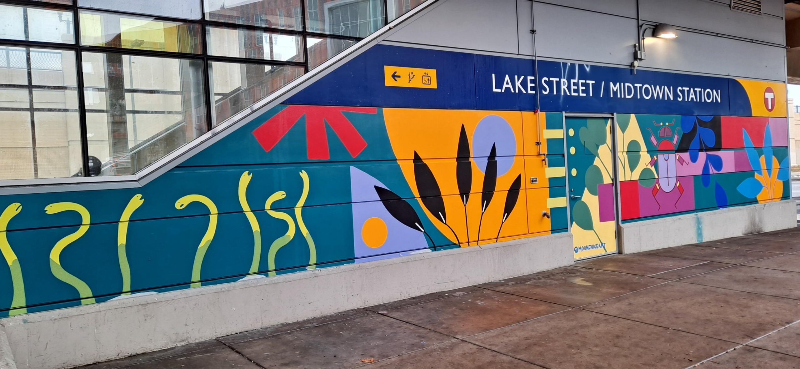
Lake Street Midtown Station Mural After