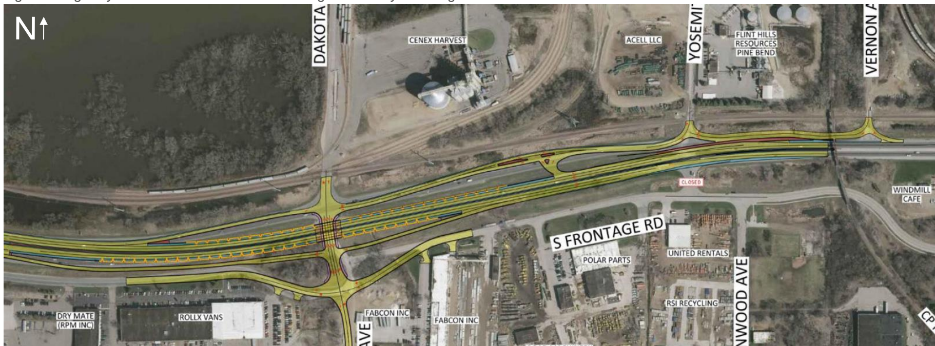
Figure 2: Highway 13 and Dakota Avenue Interchange in the City of Savage