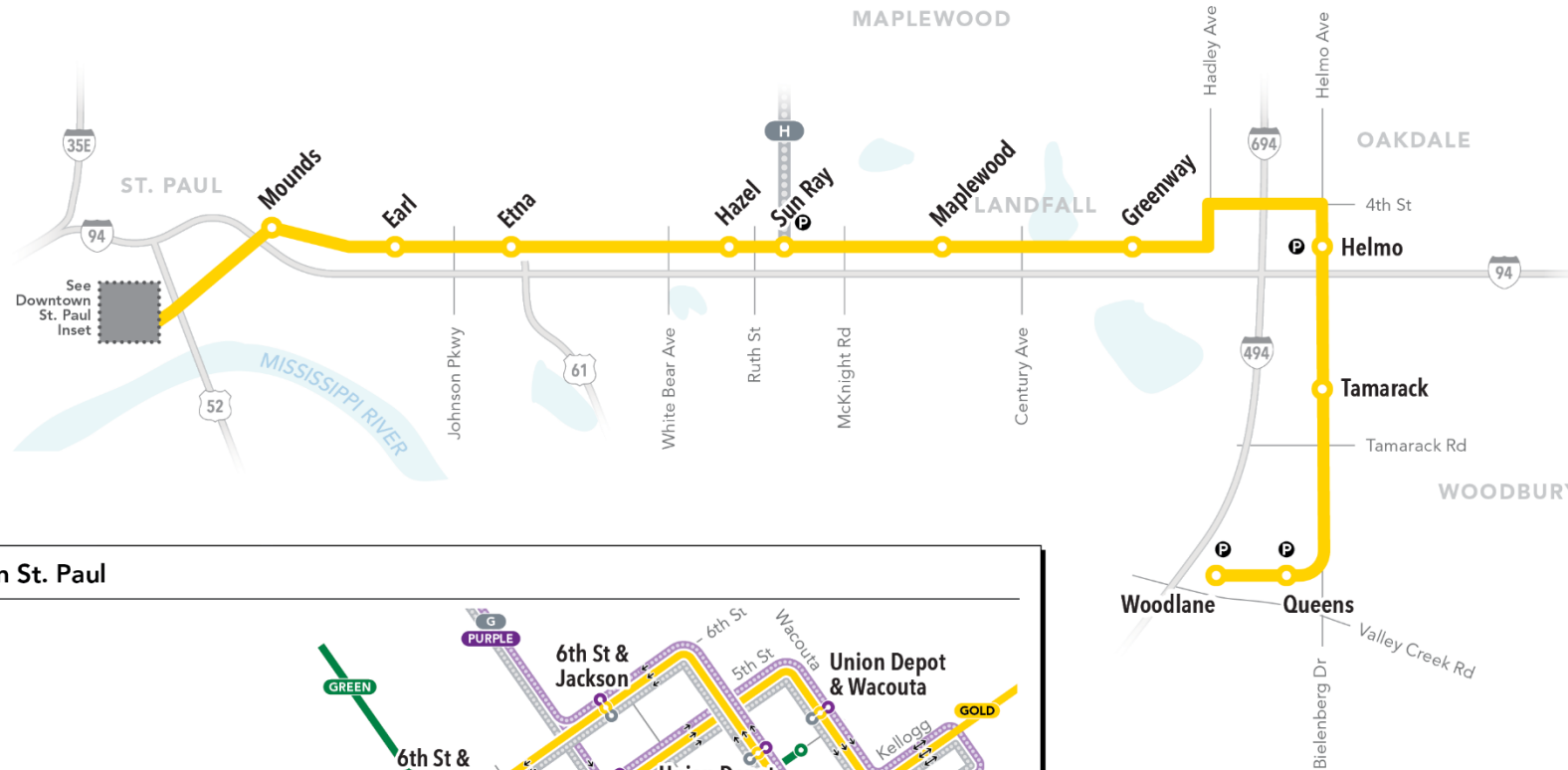
Downtown St. Paul