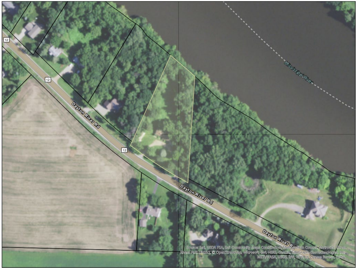
Figure 3. Image of the subject property outlined in yellow.