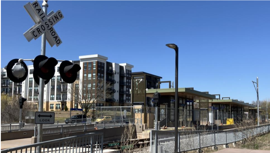
Bren Road Station Apartments, near Opus Station in Minnetonka