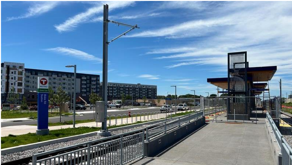
Hallon Apartments, near Blake Road Station in Hopkins