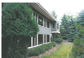
Former Wallo house.

Options for use of the former Wallo site were evaluated as part of the master planning process. The one acre property and 1940's house are City-owned property located at the northwest corner of the East Bush Lake Road/84th Street intersection and surrounded by the North Corridor Park Unit. The property sits on the top of a tall oak covered hill with great distant views. A steep, narrow (12') bituminous driveway provides access to the house from East Bush Lake Road.