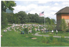
Enhancements are proposed for the Normandale Lake Park Unit bandshell area.